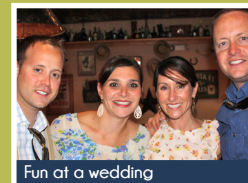
Fun at a wedding