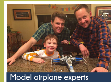
Model airplane experts