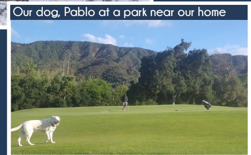
Our dog, Pablo at a park near our home

We own our home, which is a comfortable 3 bedroom, 2 bath house in a smaller town North of Los Angeles, California. Our home has a large backyard perfect for playing. Our community is a great place to raise a family, with lots of parks, bike trails and fun activities for kids. We are surrounded by mountains and the beach is a short drive away. There will be no shortage of fun things to do! Our child will get to grow up in a gorgeous, friendly town where kids ride bikes and play in our family friendly neighborhood.