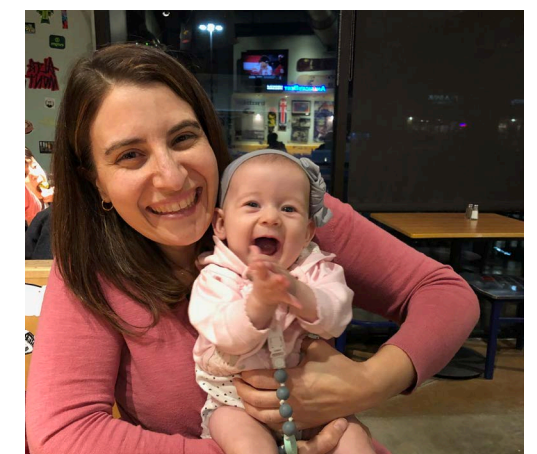
Meeting a friend's baby