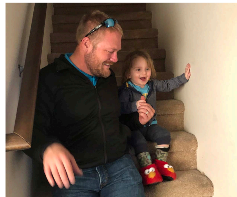
Sliding down the stairs