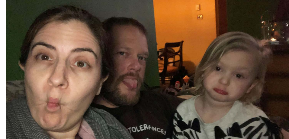
Silliness with our niece