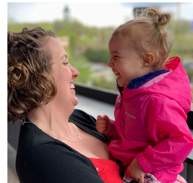
Laughing with friend's daughter

PERFECT DAY: My perfect day is sleeping in and making a good breakfast. Then, going to spend time with family doing a fun activity and hanging out together. Then trying food from a new restaurant and going home to snuggle with our dogs on the couch.