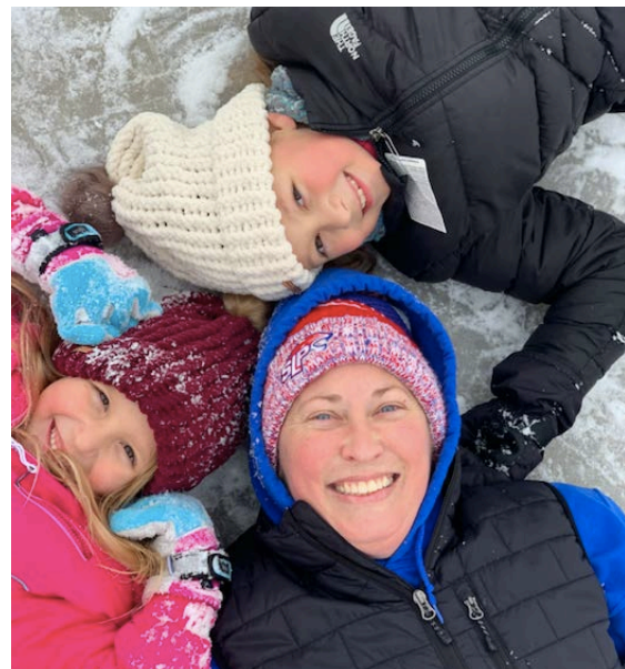
Ice skating with nieces