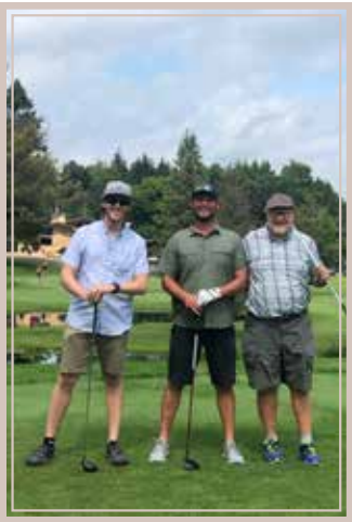
Boys golf weekend