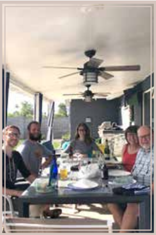
Thanksgiving 2019 - AZ