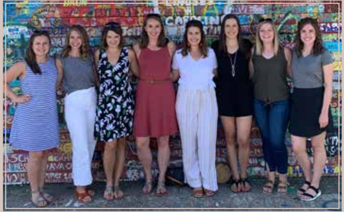
Door County girls trip