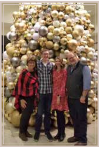
Enjoying the Christmas decor