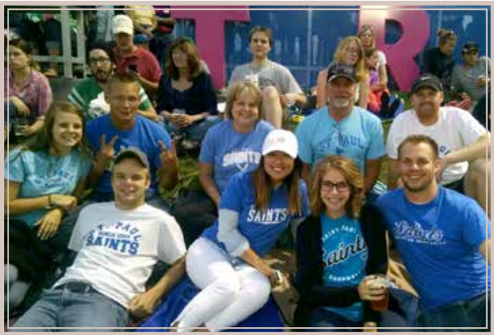
St Paul Saints baseball game

We are fortunate for the most amazing group of friends that have become family. We enjoy traveling, visiting the cabin, trying out the new local restaurant and hanging out with our friends. Our friends challenge us to be the best people we can be and we continue to grow in life through these friendships. It has been exciting to watch our friends become parents and they are all looking forward to watch us become parents as well.