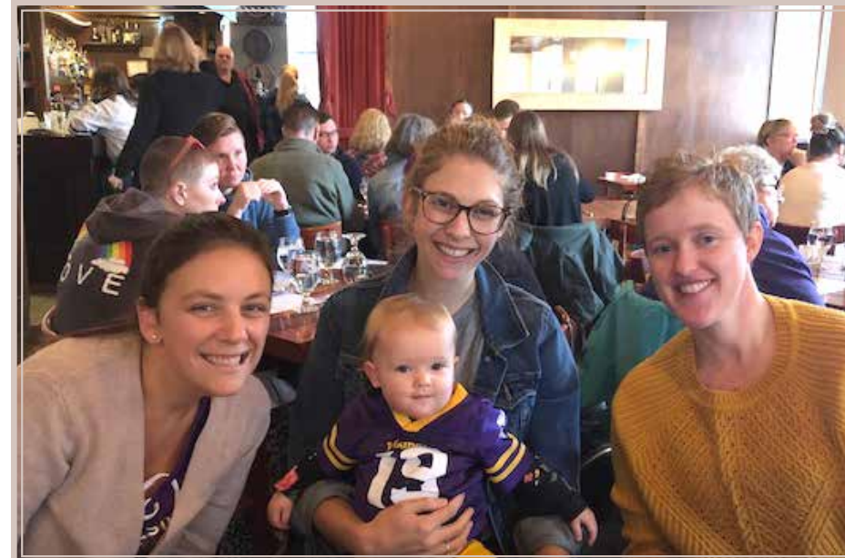
Brunch with friends