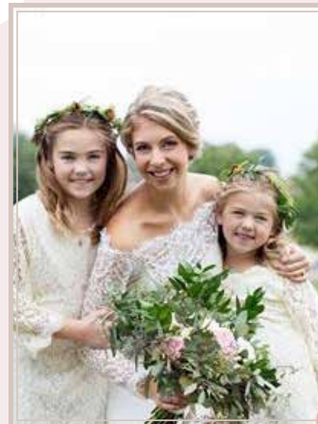
Posing with my cousins