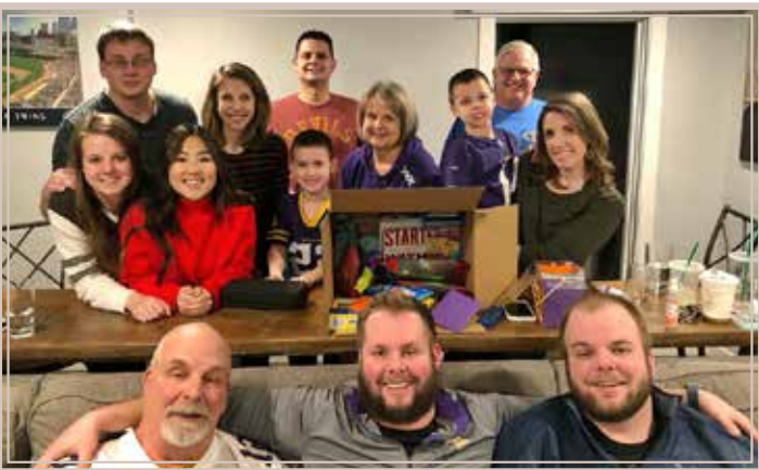
Superbowl party 2020