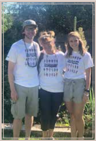
All set for MN State Fair