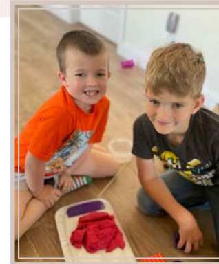
Playdate with neighbor