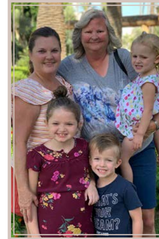
Grandma and Great Aunt adventures