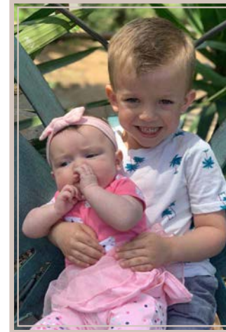
Big brother in training with cousin