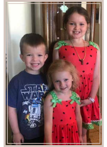
Playing with cousins