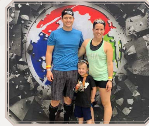
We completed the Spartan Trifecta together in 2019 (5 mile, 8 mile and 13+ mile run).