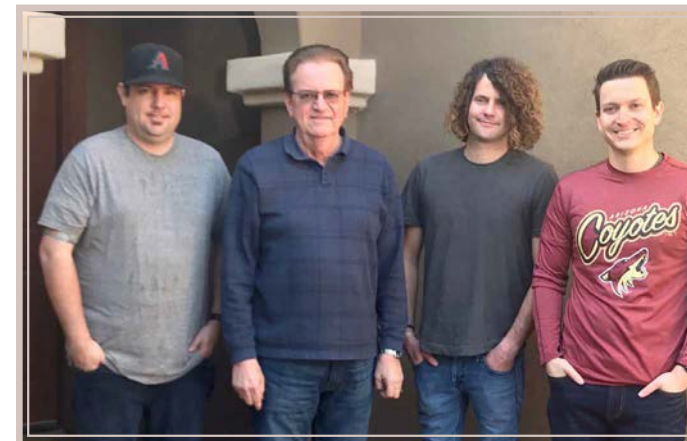
Off to a Coyotes hockey game