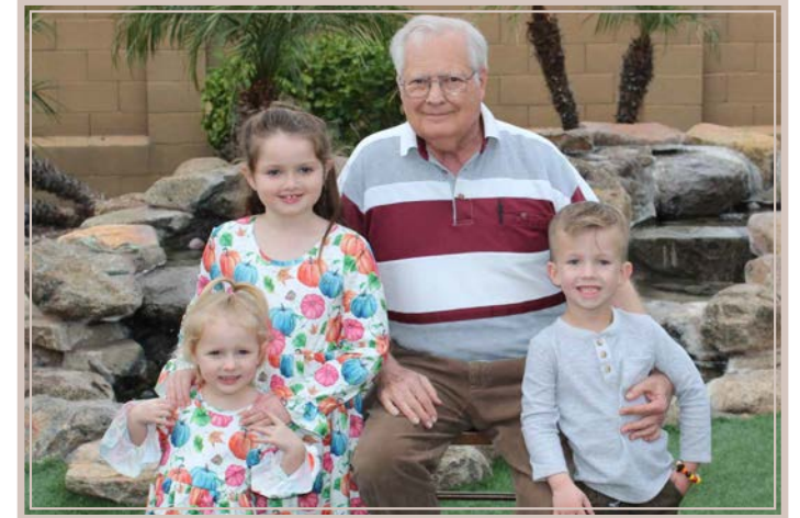
Thanksgiving day with Pa

“Our family is so important to us. They have helped shape who we are today.”