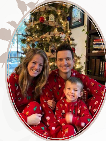
Our family Christmas tradition is matching jammies.