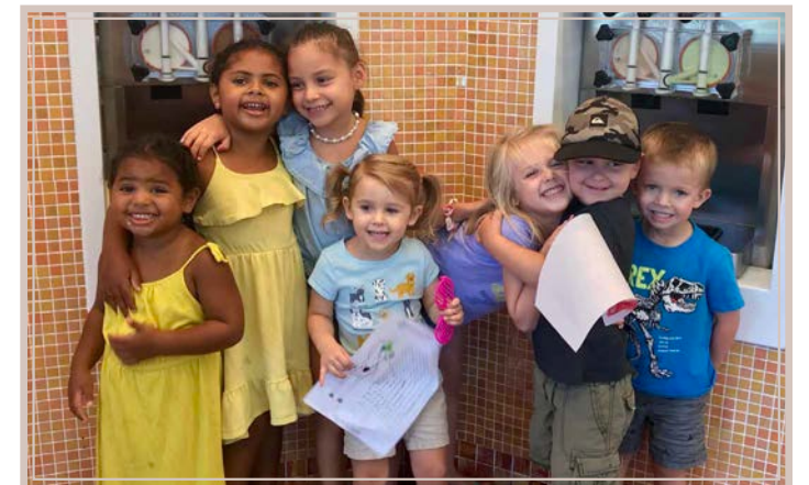
Childhood friends getting FROYO