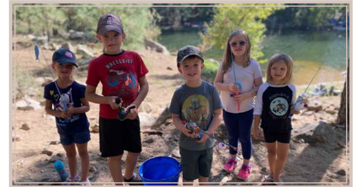
Fishing with our church group