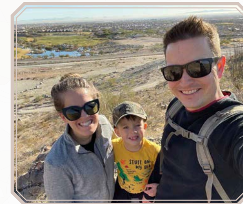
Fishing, camping, and hiking are some of our favorite family adventures.