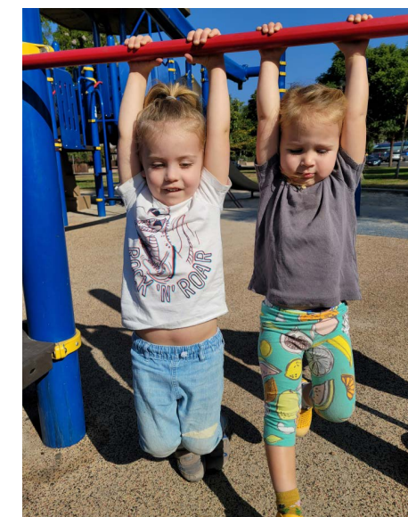
Roland's best friend Violet