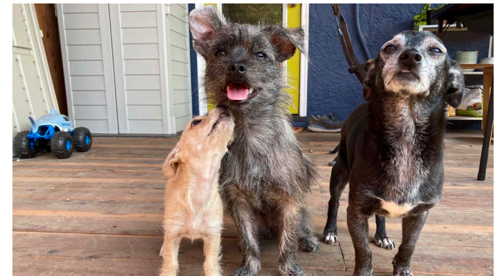
All three dogs together!