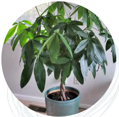
We name our plants and one of them is Groggu (the baby Yoda in The Star Wars). The force is strong with this one!