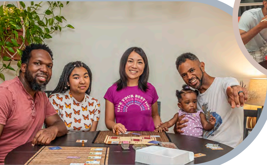
Close family friends