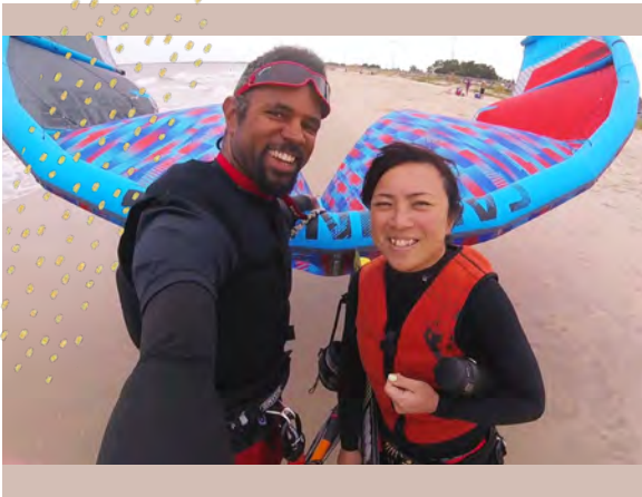
We do kiteboarding together.