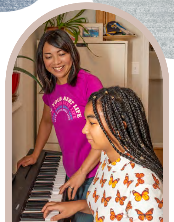
Playing music with close friend's daughter