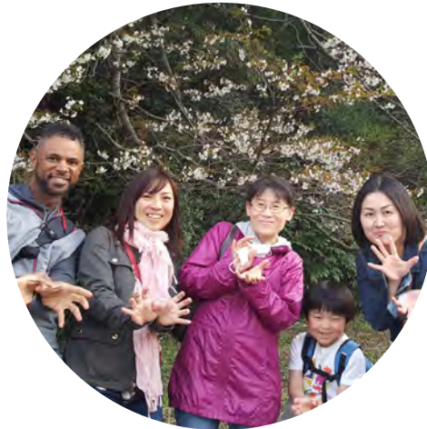
Ayano's childhood friends