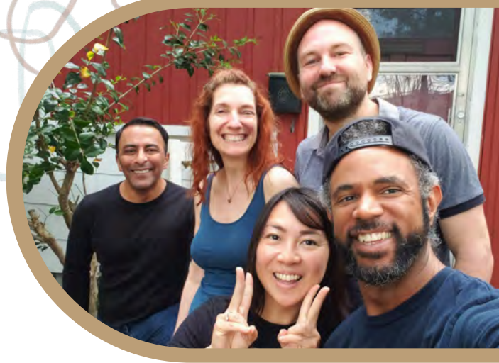
Close friend group

Our closest friends are the same to us as family. We've traveled with them and look forward to seeing more of the world in their company. Overall our extended friends' circle is composed of beautiful, open-minded souls from different ethnicities, beliefs, and walks of life. We're close with a few of our neighbors and we look forward to setting up playtime with their kids. We're also friends with quite a few guys and gals in the local kiteboarding community. Our tribe has been supportive of our adoption journey and is very excited to welcome a new member!