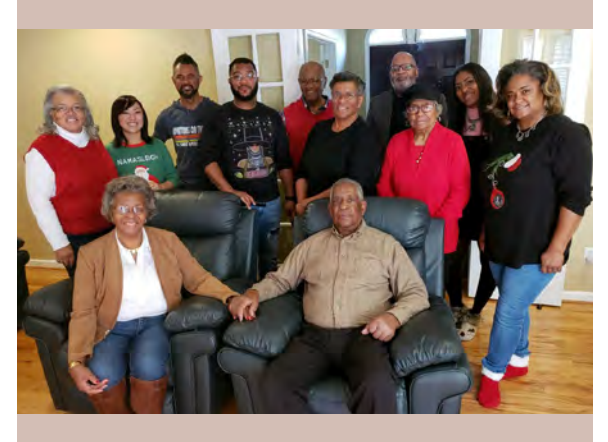
Christmas family gathering