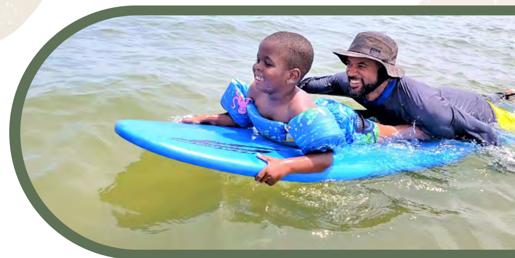
Surfing with little cousin