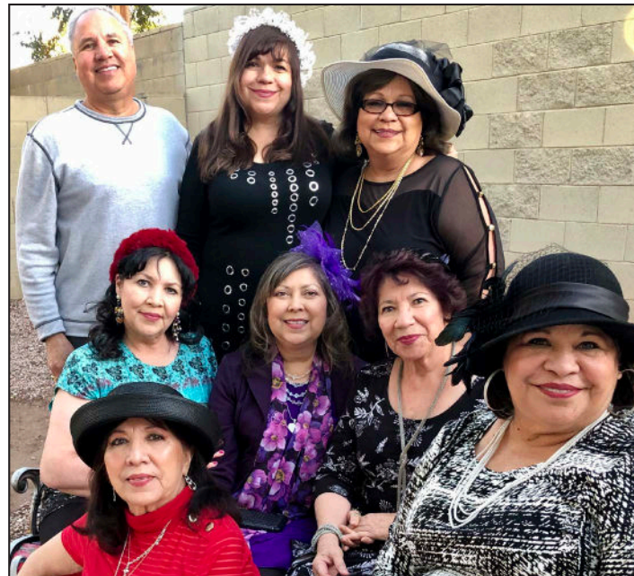
So many tias!