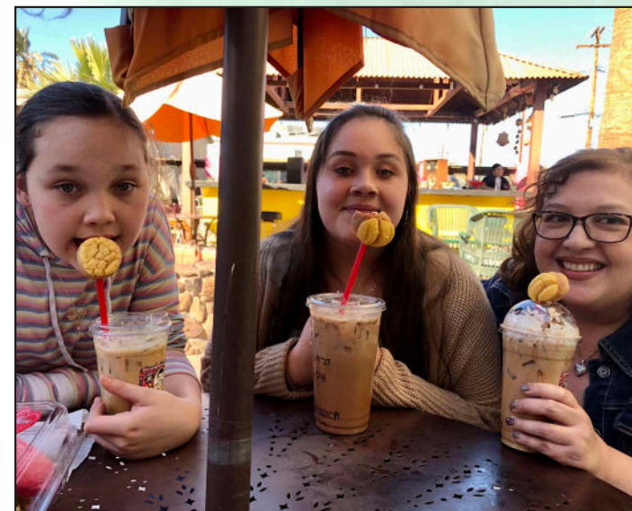
Our favorite coffee shop