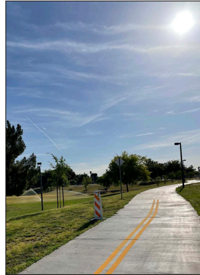
Great trail for morning walks