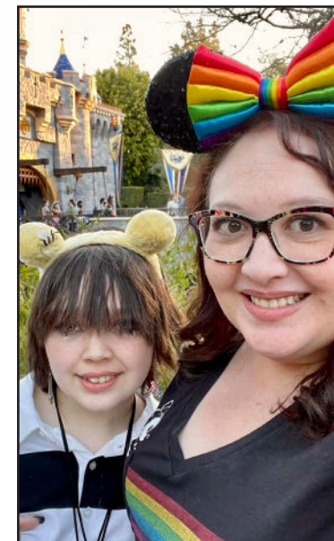
Spring break at Disneyland