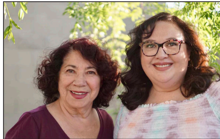
Me and my mom

“ I try to find the sacred in the ordinary moments, joy in the simple things, hope even in the hard times, and ways to put love in action every day. ”