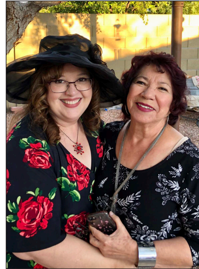
Tea party with fancy hats