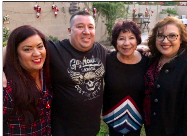
My brother and sister-in-law