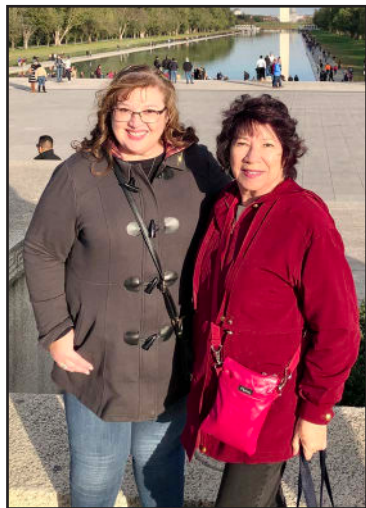
Being tourists in Washington, D.C.