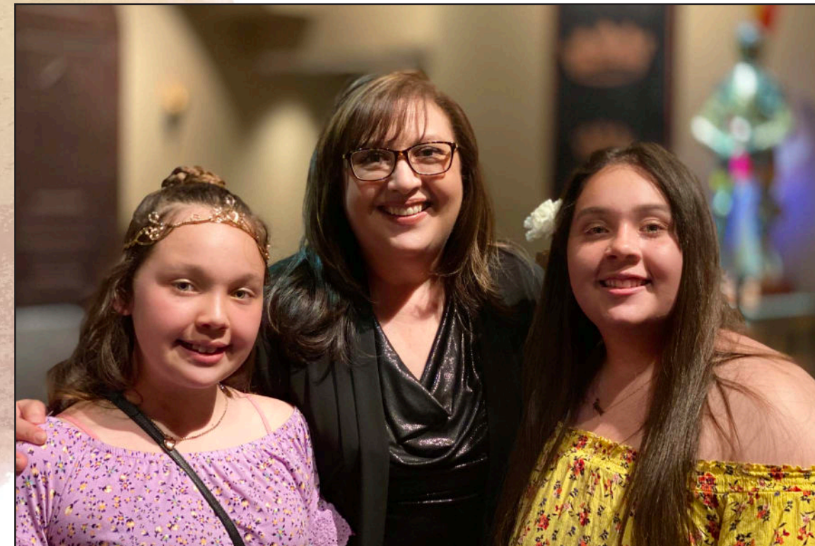
Love my nieces!