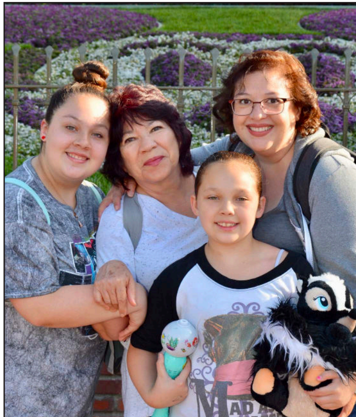
Family time at Disneyland!