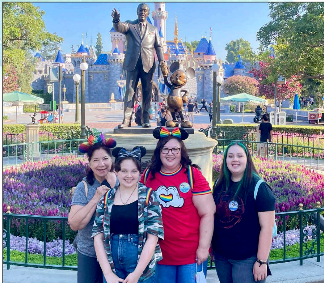
Disneyland with mom and nieces