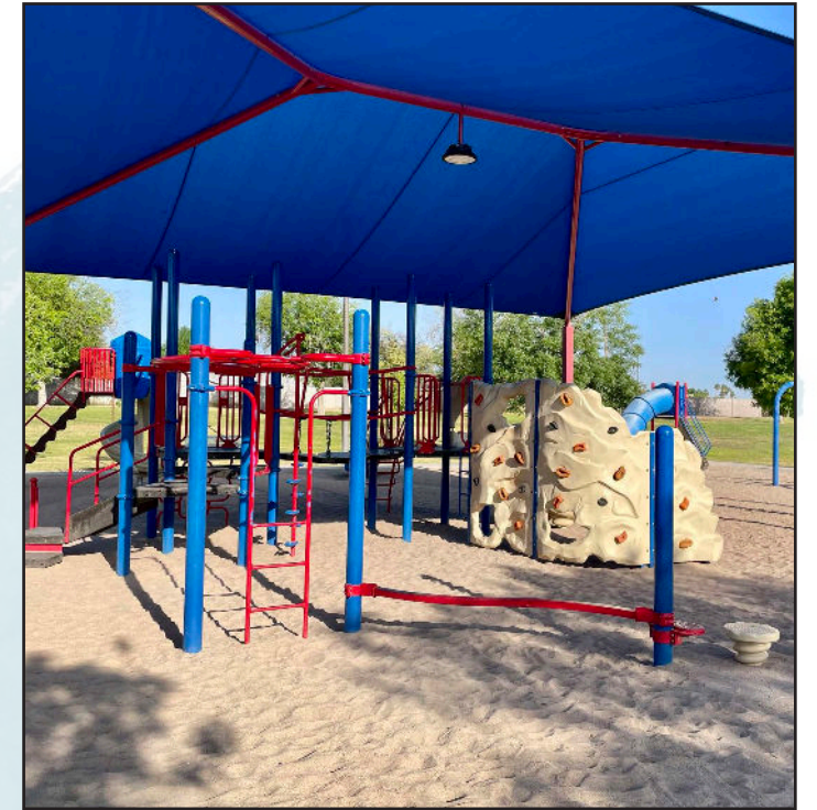
The neighborhood playground