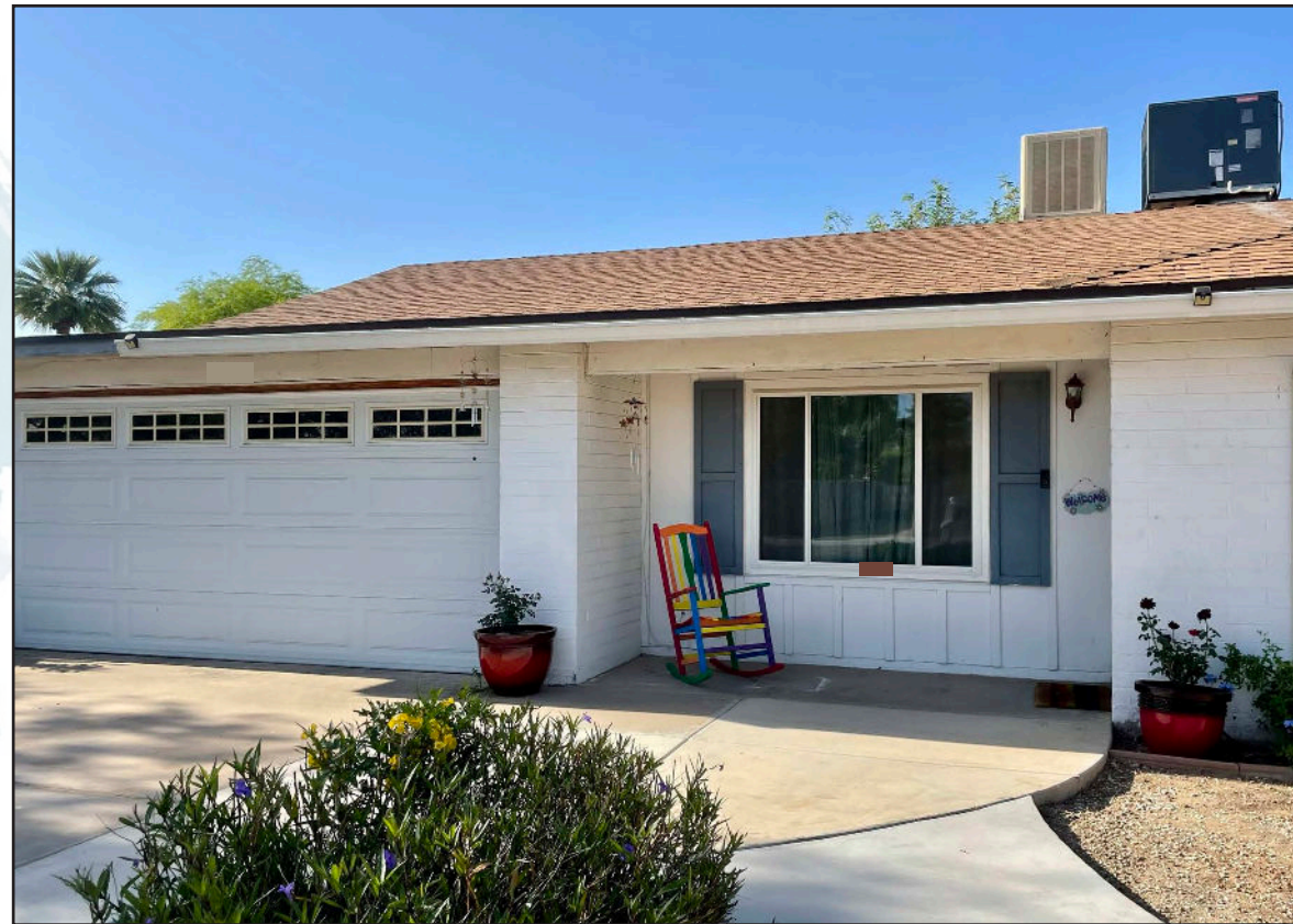
Home sweet home