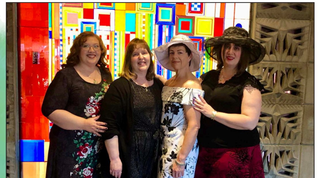
Afternoon tea with friends