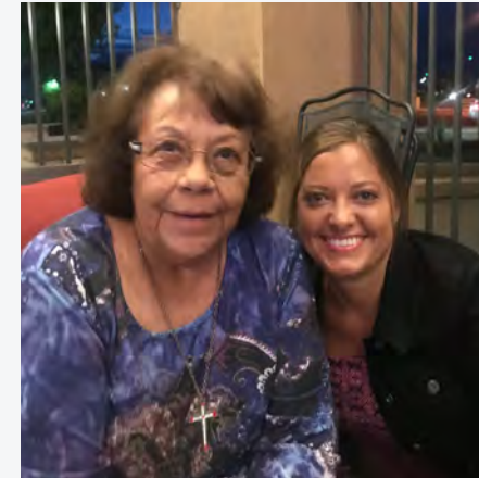
My sweet grandma