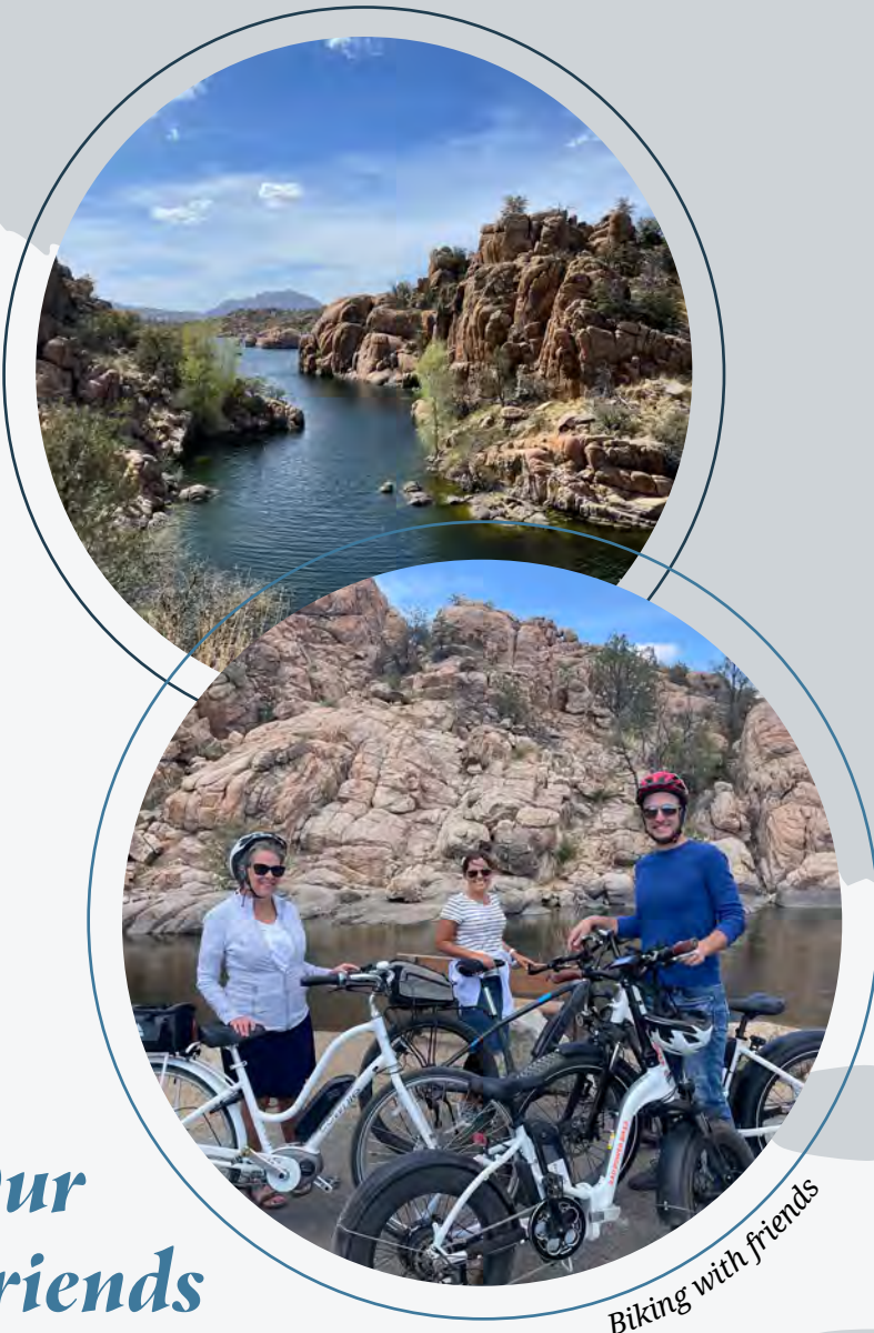
Biking with friends