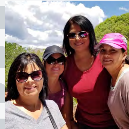
Hiking in Sedona with aunts