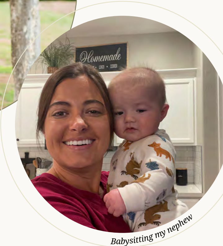
Babysitting my nephew