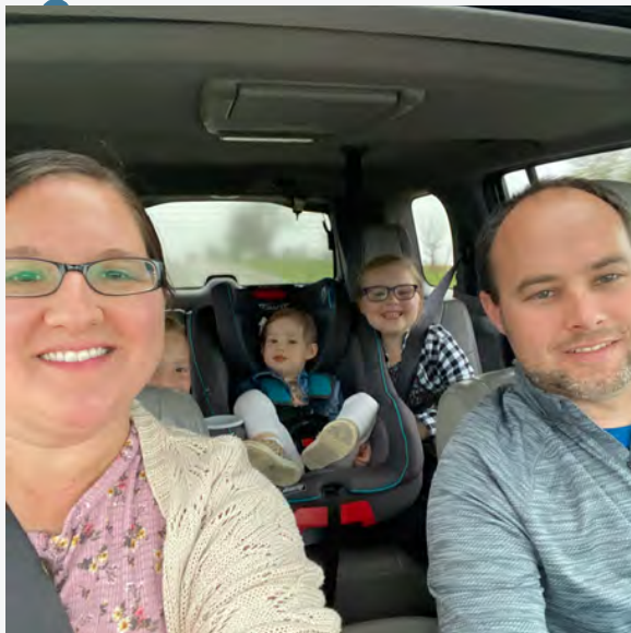
Our best friends