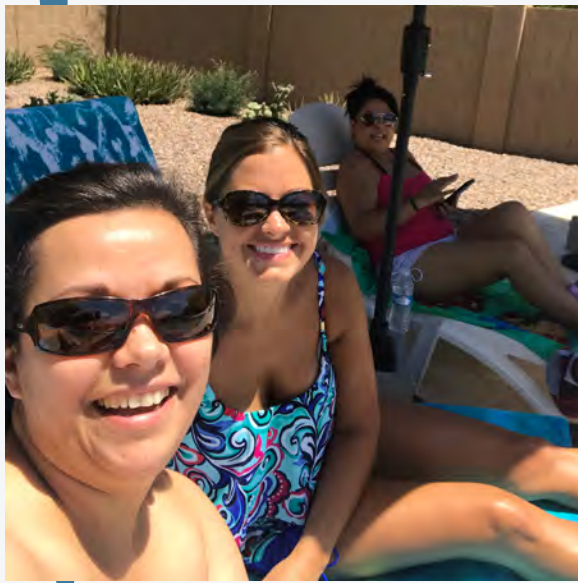
Pool time with aunts

We live in a single-story, 4 bedroom 2-bathroom home in Arizona, otherwise known as “the valley of the sun”. Our neighborhood has lots of children who love to ride bikes and play on the playground close to our house. We have a lovely back yard where we like to spend time grilling in the summer or relaxing by the fire in the winter. We can't wait to have 2 little feet pitter patter around and making hand prints on our windows.