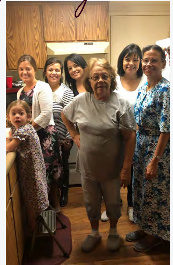
Making tamales with my family