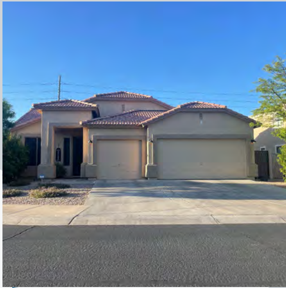
Our beautiful home