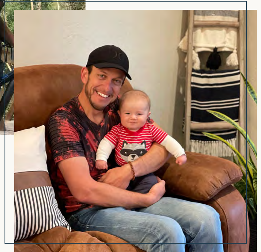
Cuddling with my nephew