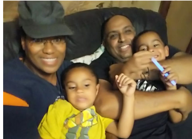
Visiting our nephews

We have always wanted to adopt and when we started struggling with fertility issues, we knew it was time to move forward with adoption and start to build our family.