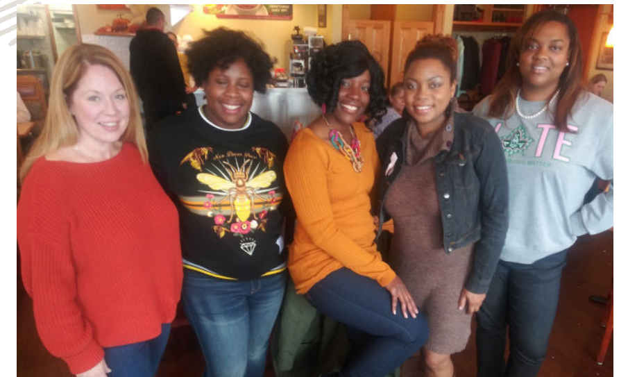
Celebrating friend's birthday