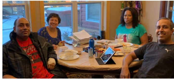
Brother and sister-in-law