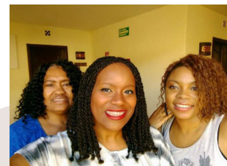
Vacation day with mom & friend