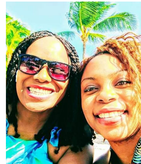
Beach Vacation with a friend