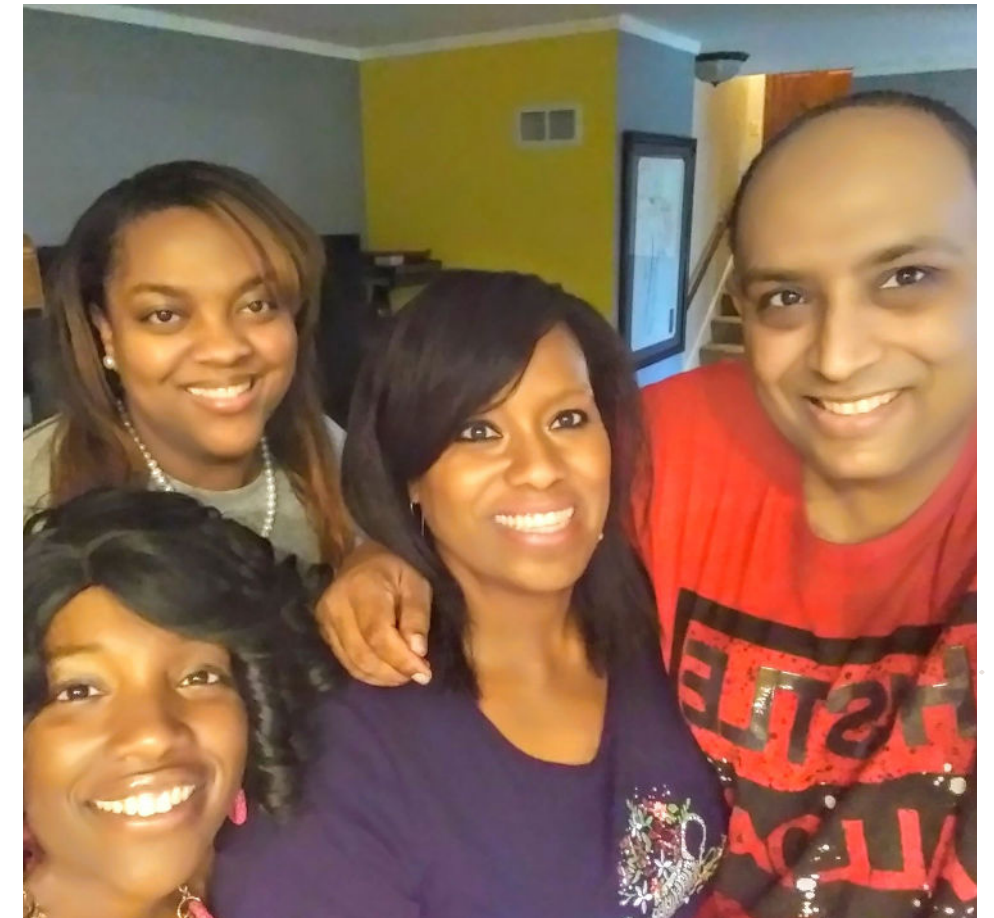
Dinner Party with friends