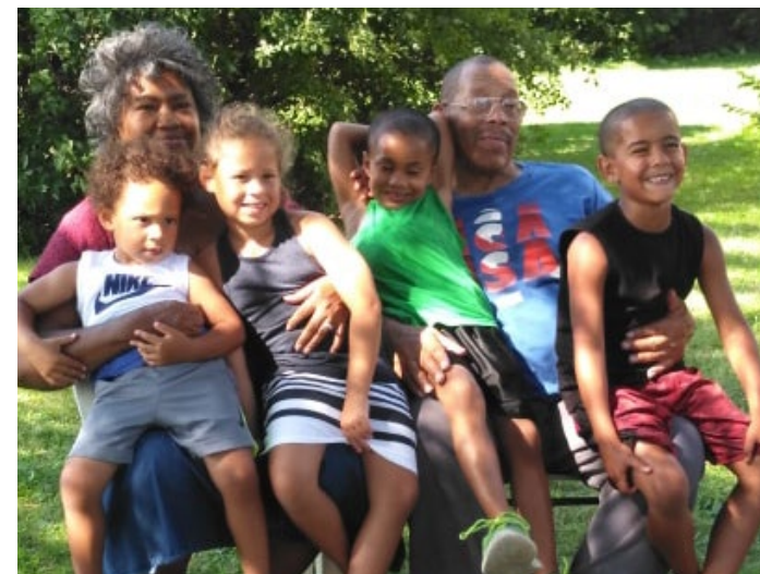
Grandparents cuddling with grandchildren