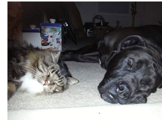
Relaxing with pets