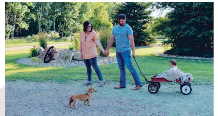
An evening stroll as a family