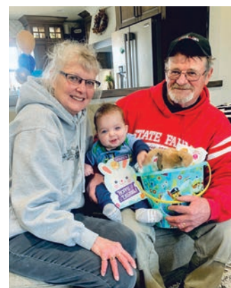
Easter with Greg's dad & stepmom