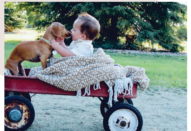
Just a boy and his puppy