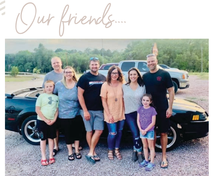
Evening out with friends