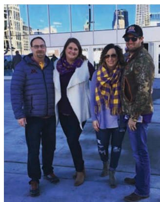
Vikings game with Greg's sister & brother-in-law