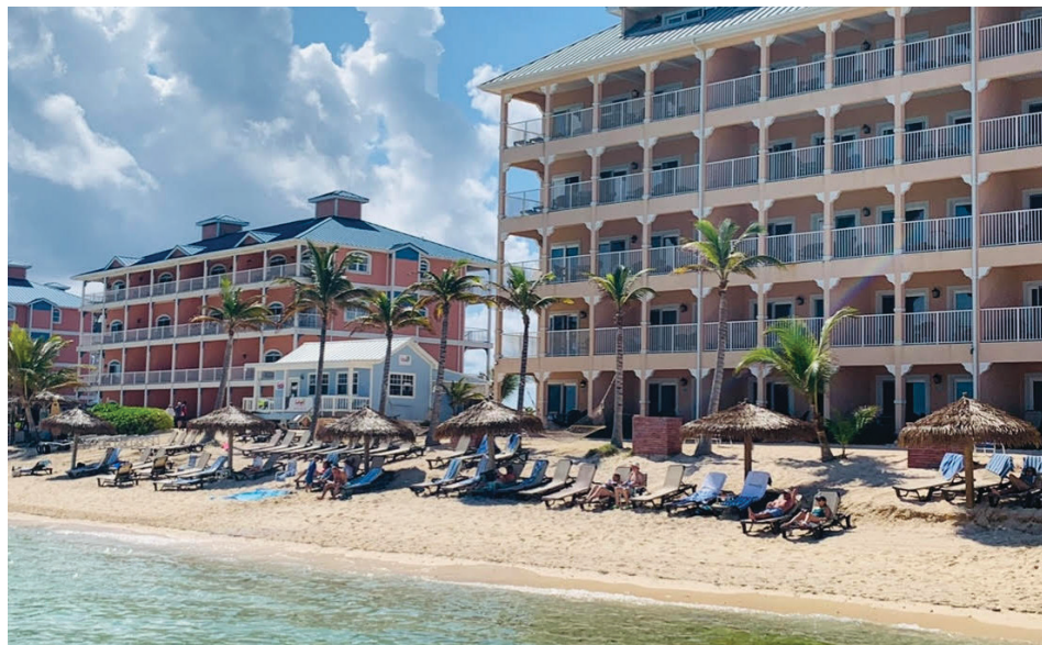
Our happy place: Grand Cayman