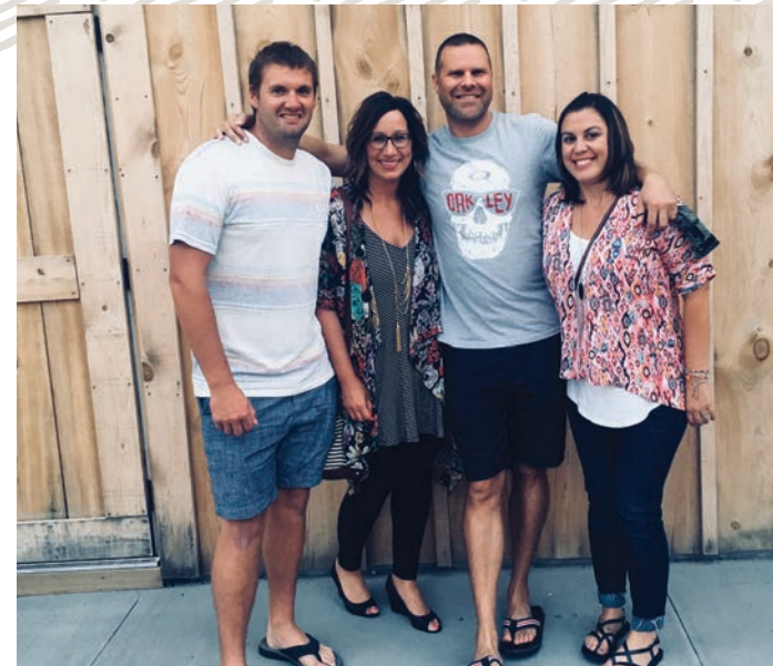
Dinner with friends