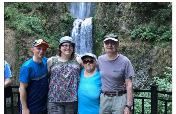
Sightseeing with Tom's parents