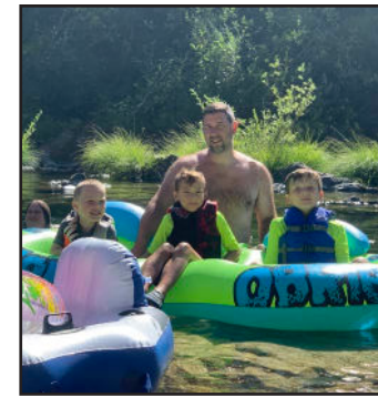
Cousins playing in river

Perfect day: Reading books, listening to music and signing, lots of yummy food, other children to play with, a swim in pool, a trip to the park and then ending the day with an outside fire roasting some marshmallows.