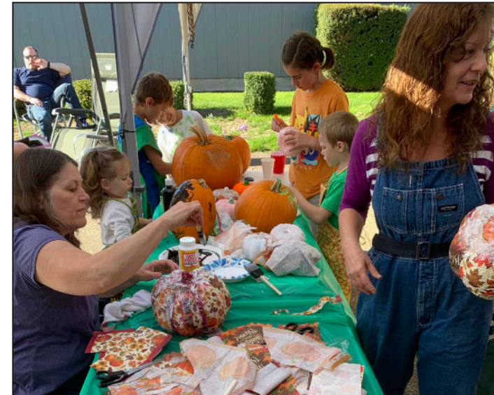
Crafts at Harvest Party