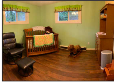
Our baby room