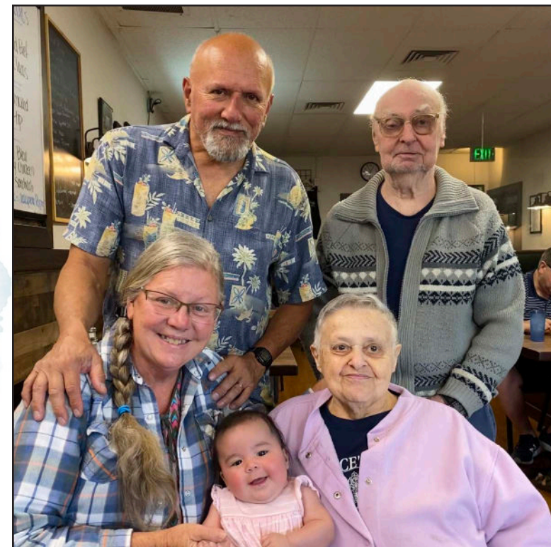
Dinner with the Grandparents