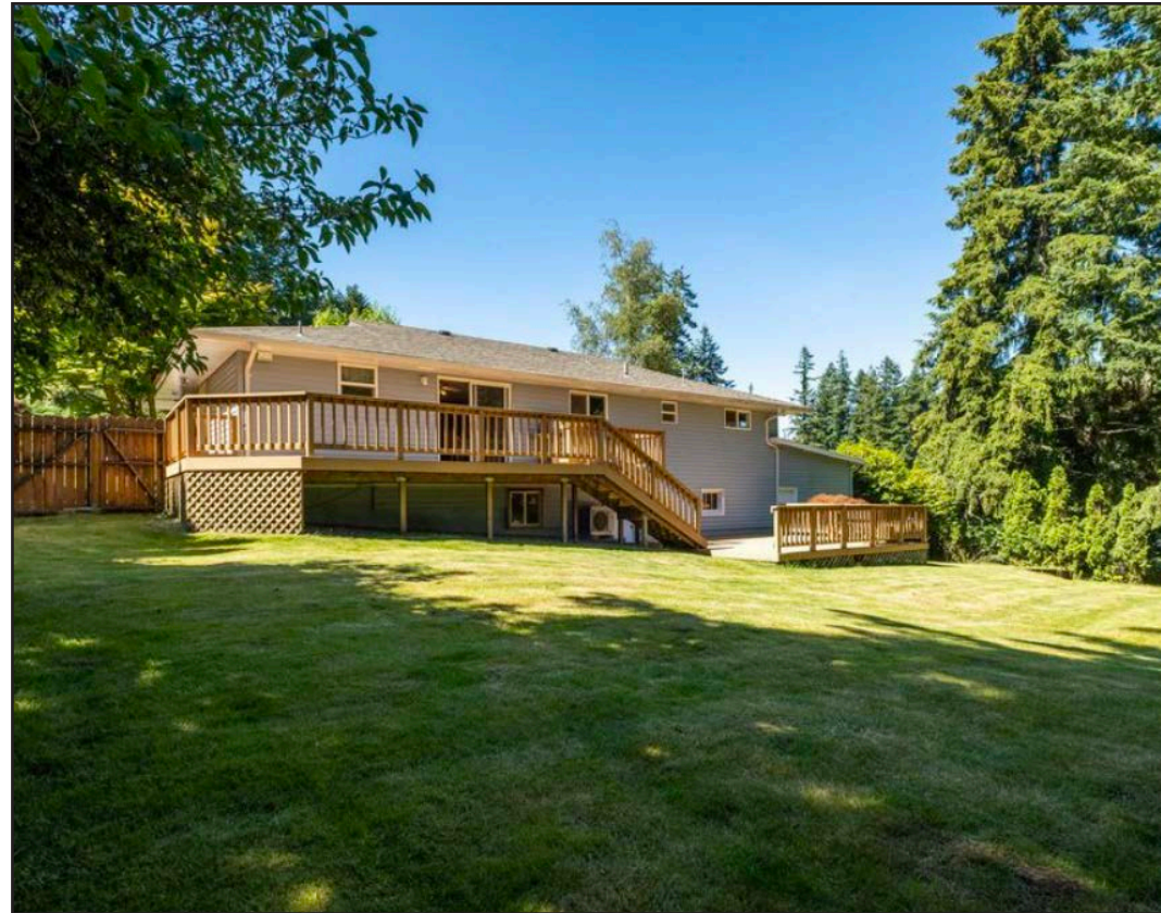
Our spacious backyard