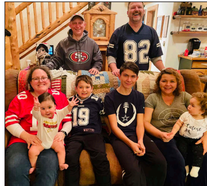
Weekend away with friends