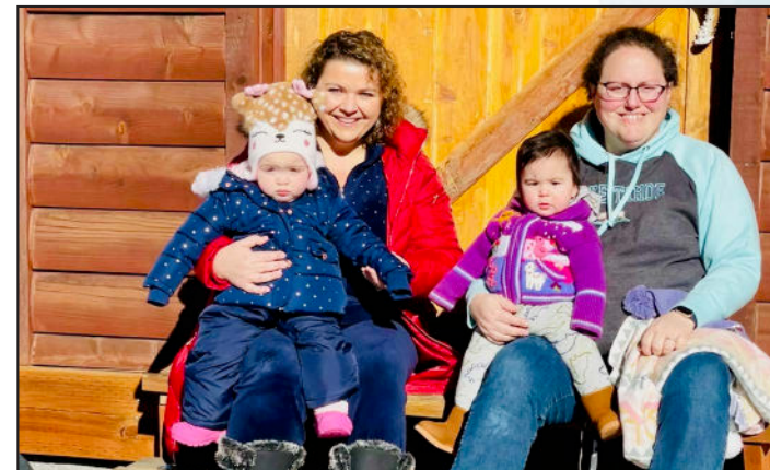
Our daughters through adoption