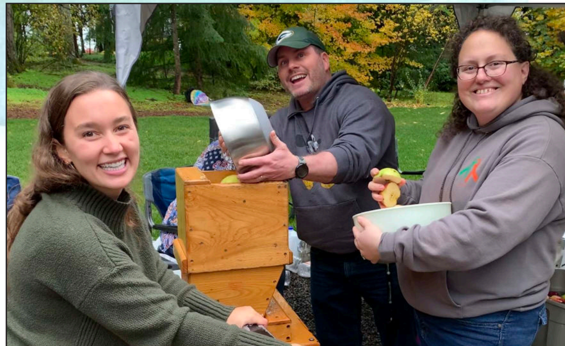
Making cider with family