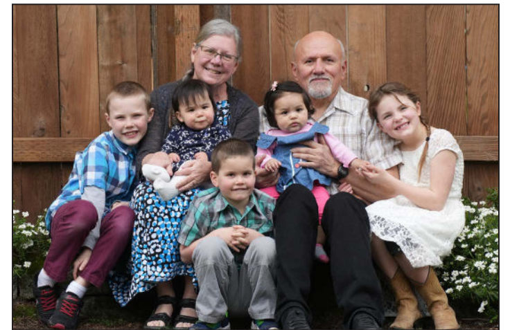
Grandparents and all the grandkids