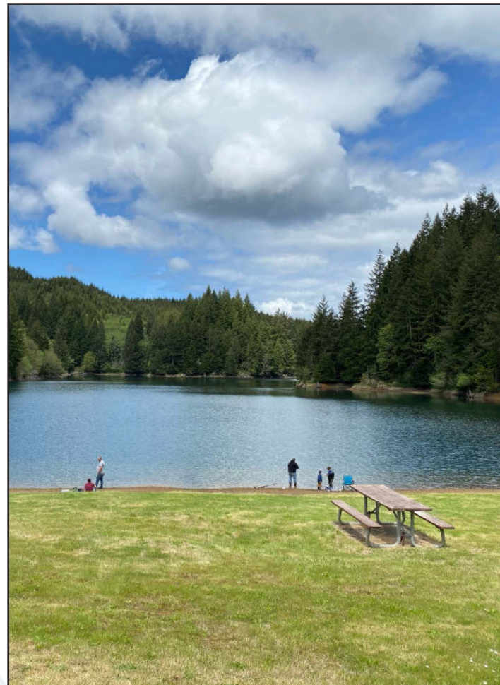
A lake near us

We live in a small community in Oregon that offers a lot to families, and is just a few minutes from the ocean and an awesome Aquarium. We have 2 parks in walking distance that we frequent, and the local library is a great place where we go at least once a week for story time. We are both active in the community and enjoy our friendships with other parents in our town.