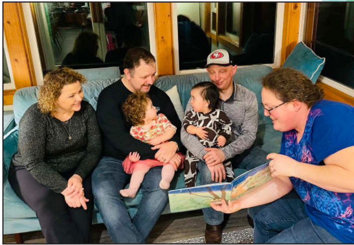
Reading an adoption book