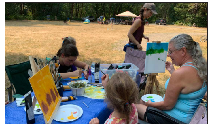
Family painting while camping