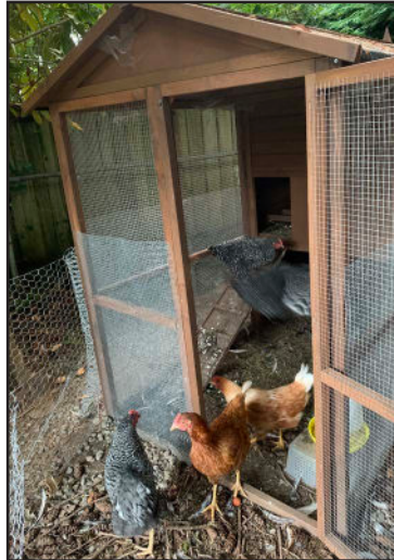
The chickens greeting us