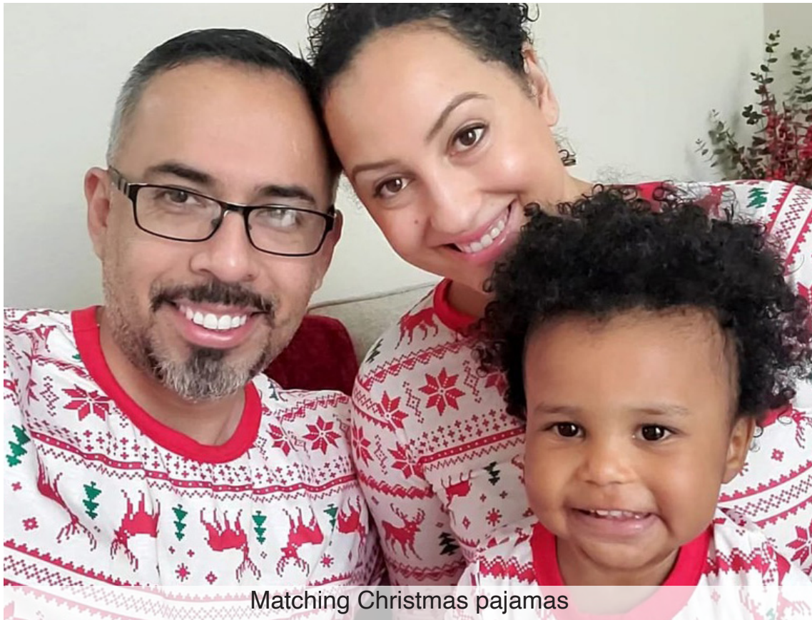
Matching Christmas pajamas

We will expose your child to as many different people, cultures, places, activities, and beliefs as possible to help them establish their own sense of identity, confidence, and purpose in the world. It is through open-mindedness, education, and exposure to all walks of life, that one can begin to accept and love one another just as they are.