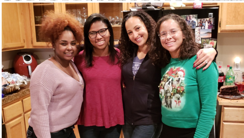
Cooking with my cousins