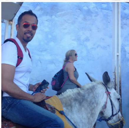
On a donkey in Greece