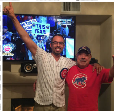
Watching a Cubs game

I was born and raised in Illinois. My favorite childhood memories involved Thanksgiving dinners with my whole family and hanging out with my siblings. I also loved basketball, baseball, video games, and anything that involved me being outside.