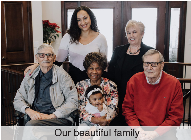
Our beautiful family

Our family is a melting pot of African American, Mexican, Ukrainian, and other ethnicities blended together. We celebrate diversity and enjoy experiencing other cultures through food, language, customs, traditions, and travel.