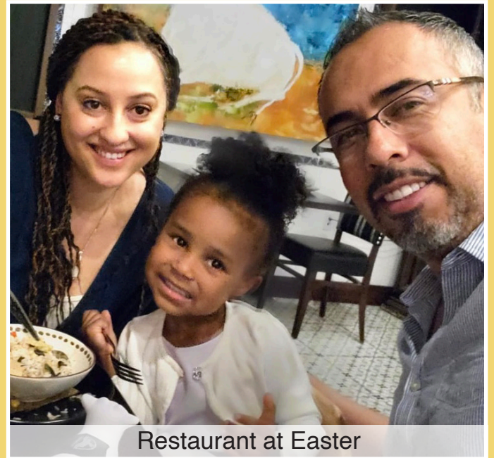
Restaurant at Easter