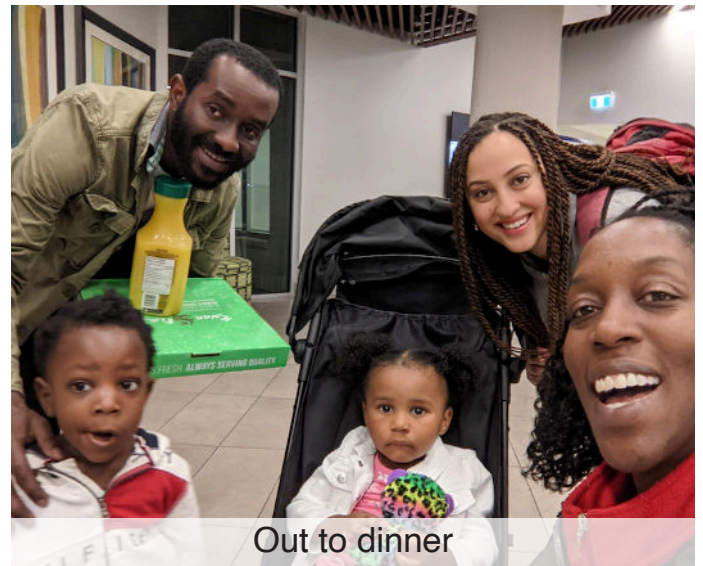
Out to dinner