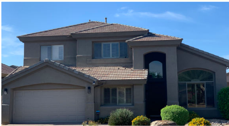
Our home sweet home

We have a spacious backyard with grassy space to play, covered patio, and a pool for those hot days. When it's super hot, we have a playroom inside. We love living here because we can enjoy a quiet, residential neighborhood, while feeling surrounded by a lively community. The best of both worlds.