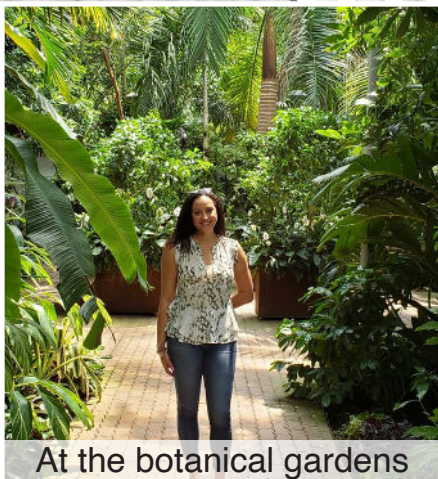
At the botanical gardens

Fun Fact: I was a competitive dancer for 14 years.