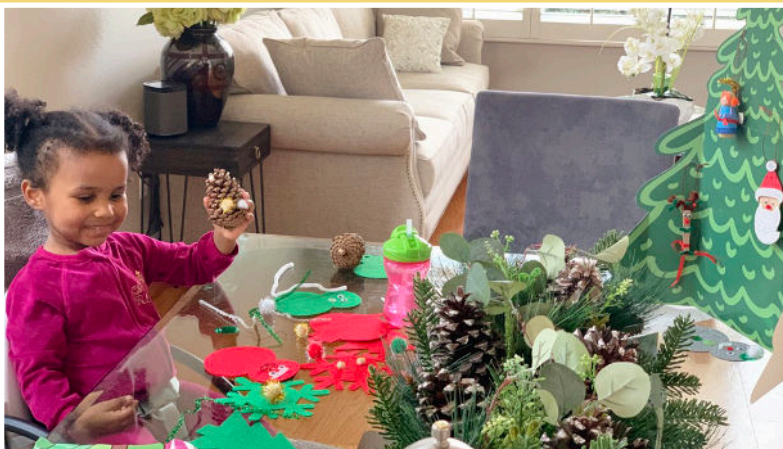
Making Christmas decorations