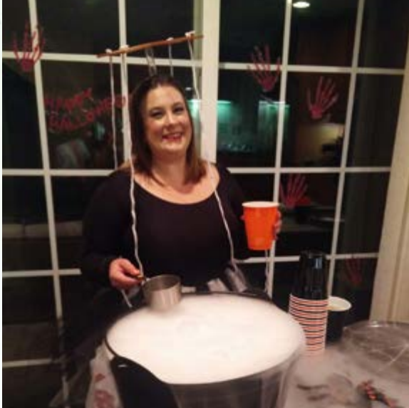
Trick or Treat - Halloween fun.