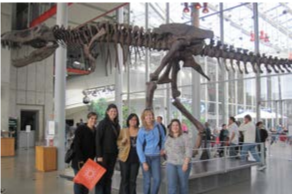
Geeking out at the Academy of Science