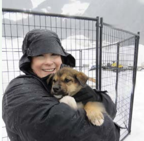
Puppy cuddles at a dog sled camp in Alaska.