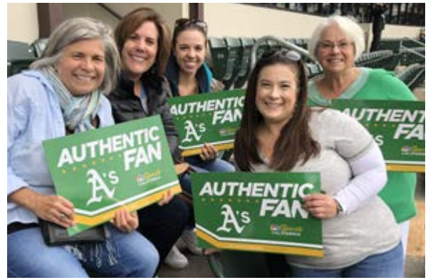
Mother/Daughter Day at the game - Go A's!

When you talk about crazy, unconditional love and support, my family is just that. My parents have been married for 51 years and I have two younger brothers, a sister-in-law, and the most adorable nephew. We all live within 30 minutes of my parents house, meaning we spend a lot of time together - from birthdays and holidays to Sunday dinner and even vacations.. We are always there for each other and they cannot wait to add another child to love on.