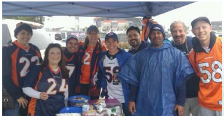
Tailgating with friends before the Broncos/Raiders game.