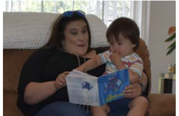
Reading my nephew his favorite book - Rainbow Fish