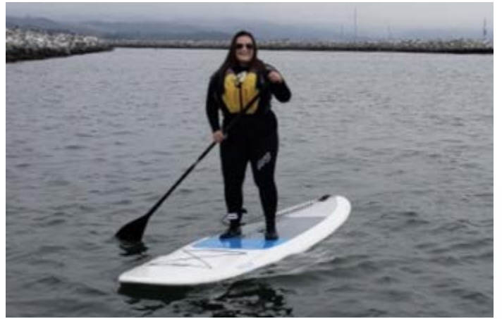
Paddleboarding on a Saturday morning in Half Moon Bay, CA