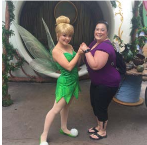
Tinkerbell! My favorite Disney Princess.