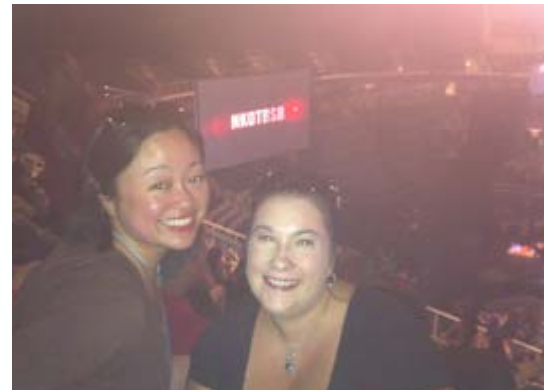
NKOTB concert - our annual tradition!