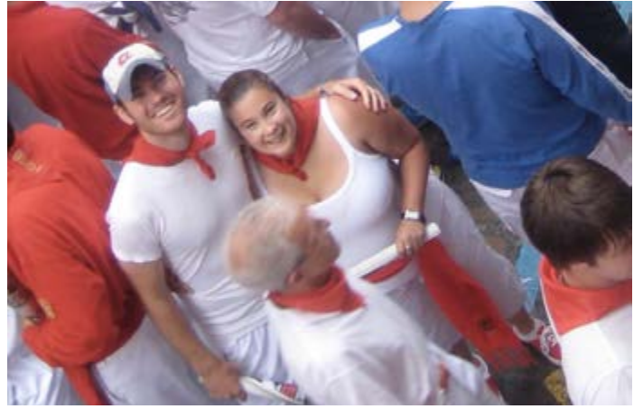
Getting ready to run with the bulls in Pamplona, Spain.