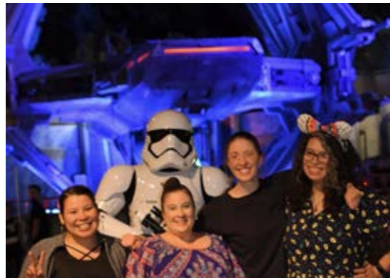
Star Wars Land at Disneyland