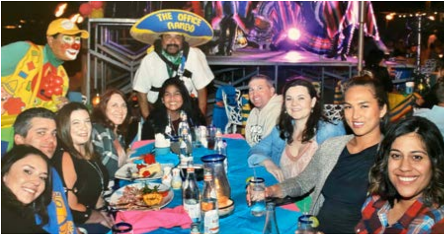
Birthday dinner on the beach with friends and family.