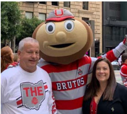
With my dad, cheering on the Buckeyes!