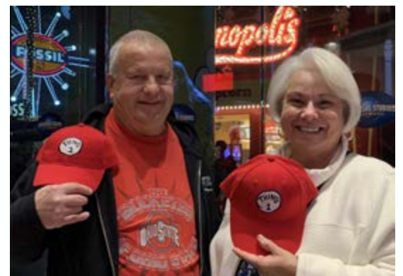
My parents have hats picked out for my nephew and grandbaby #2.