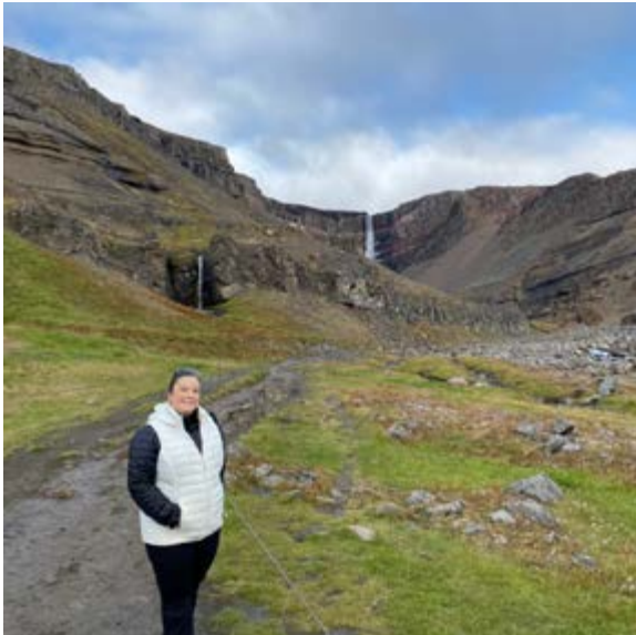
Hiking in Iceland.