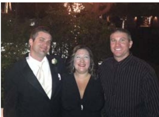
A girl and her brothers - best friends forever.