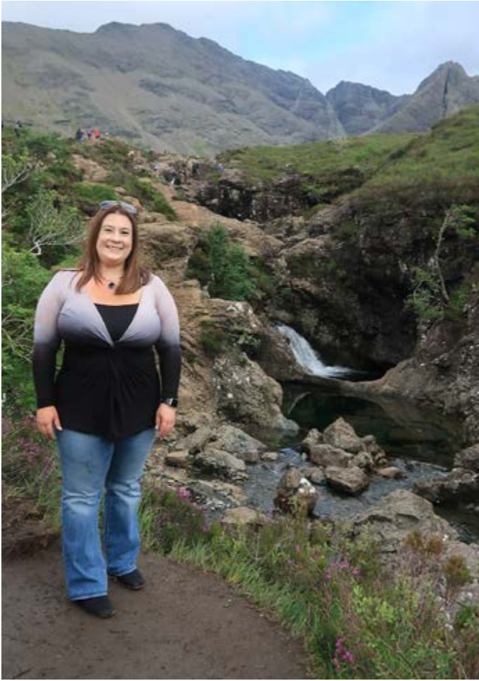
Hiking to the Fairy Pools on the Isle of Skye, Scotland.