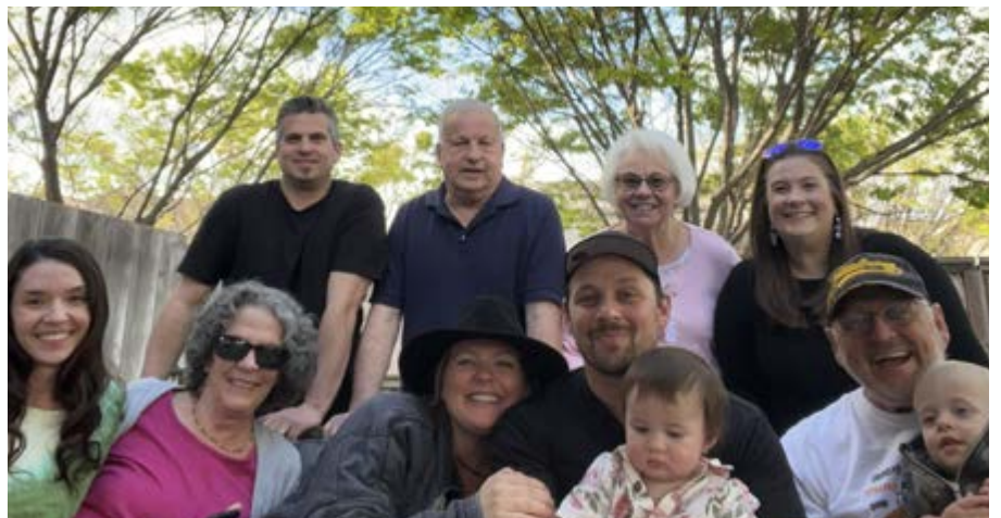
The family celebrating my nephew's 1st birthday.