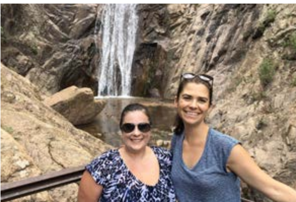
Hiking with friends

In addition to my family, I have a fantastic and diverse group of friends. They have been with me during all the bends in the road and can't wait to be part of my "village" in raising a child.