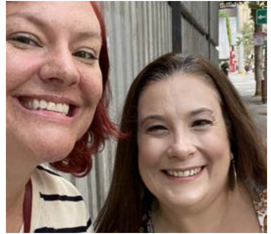
A day in San Francisco with my BFF