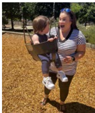
A day at the park with my nephew.