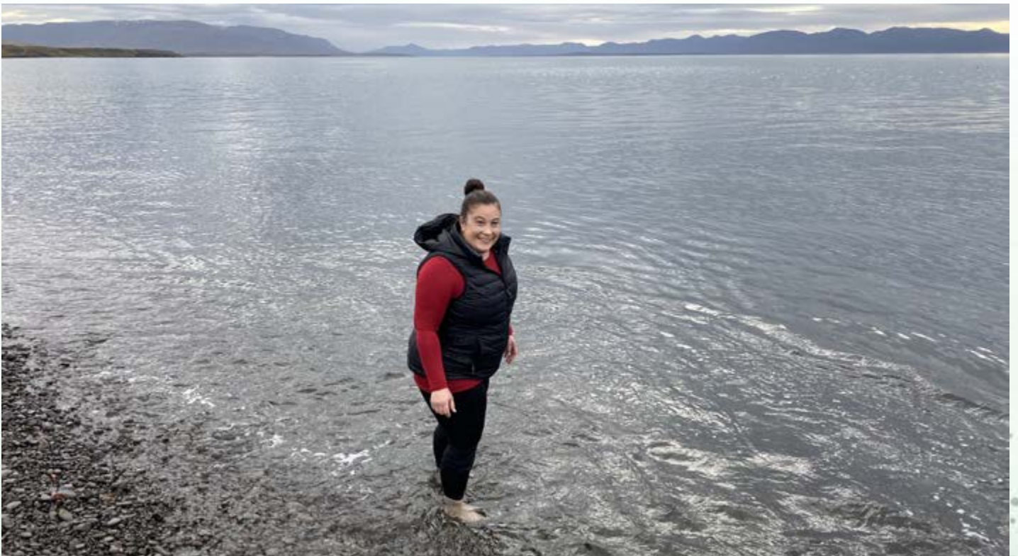
Just had to put my feet into the Arctic Ocean - brrrrr!