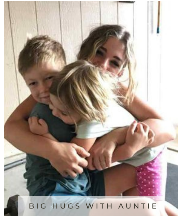
BIG HUGS WITH AUNTIE