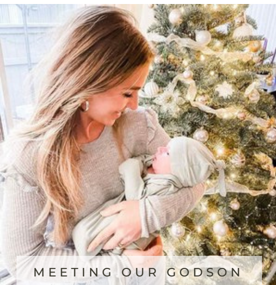
MEETING OUR GODSON