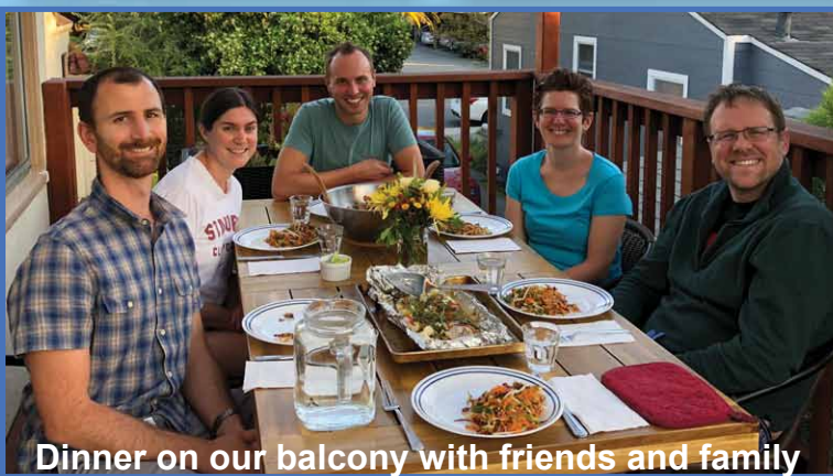
Dinner on our balcony with friends and family