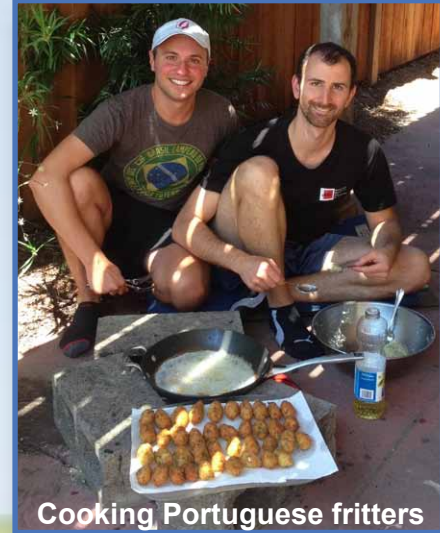
Cooking Portuguese fritters