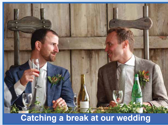
Catching a break at our wedding

We met on the first day of graduate school, but it was another five years before we ran into each other again — literally — since we collided while jogging around the university campus! After reconnecting, we started running together and realized that we had much more in common than just our names.