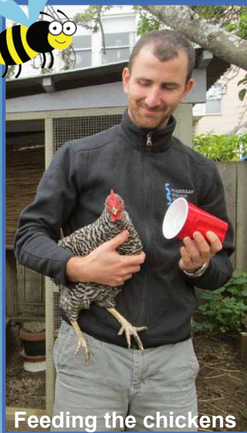
Feeding the chickens