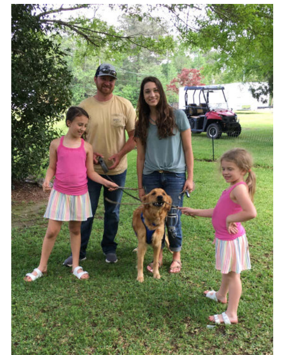
Timber with the nieces