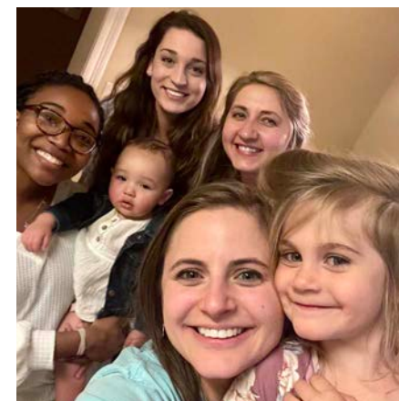
Girls night with friends