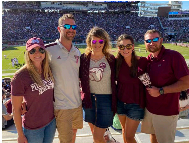
Football game with siblings