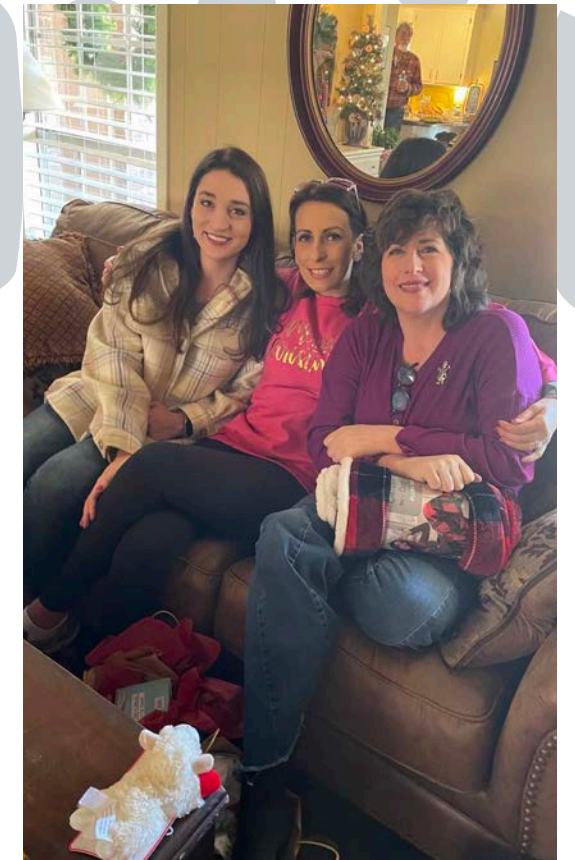
Fun with mom and sister