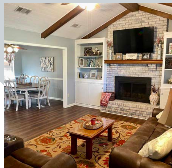
Living & dining room