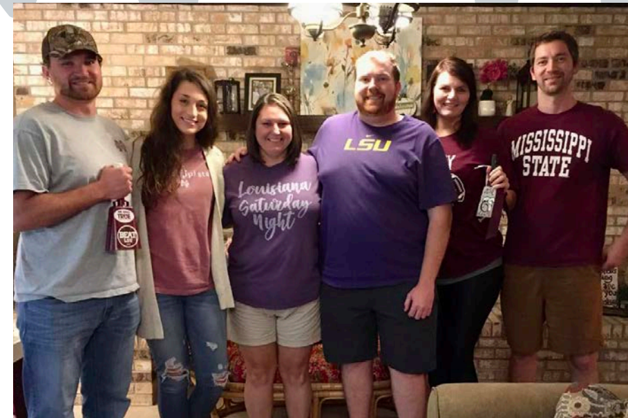
Sibling football rivalry