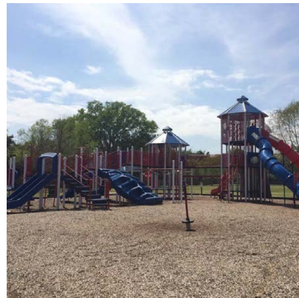
Our local park