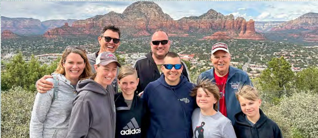
SEDONA WITH FAMILY