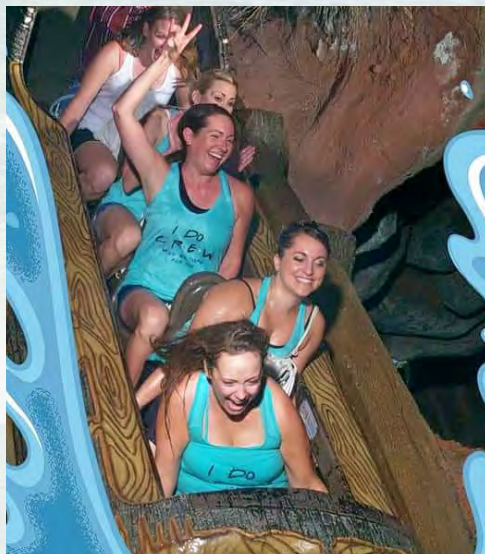
DISNEYLAND WITH KIM'S BEST FRIENDS