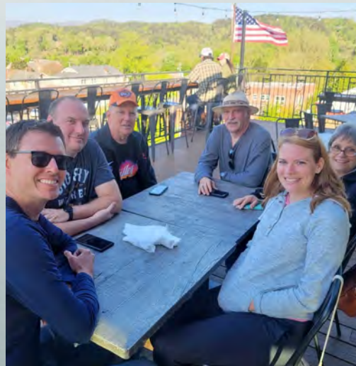
KIM'S UNCLE & AUNT ON DAD'S SIDE