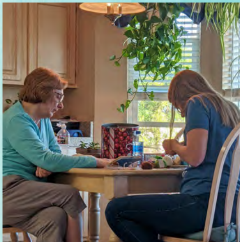
CROCHETING WITH MOM