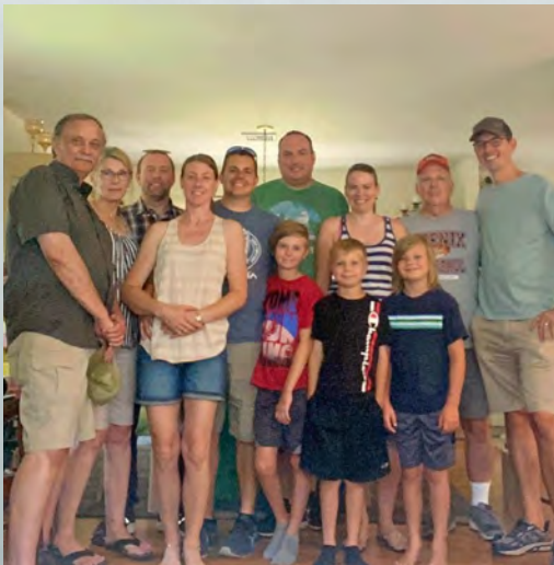
KIM'S AUNT & FAMILY MOM'S SIDE