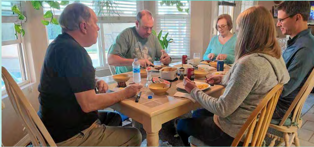
SUNDAY DINNER AT KIM'S PARENTS'