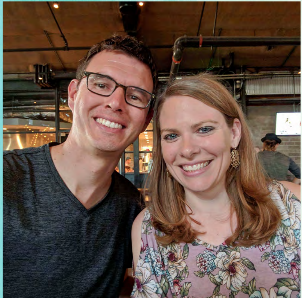
REENACTING OUR FIRST DATE