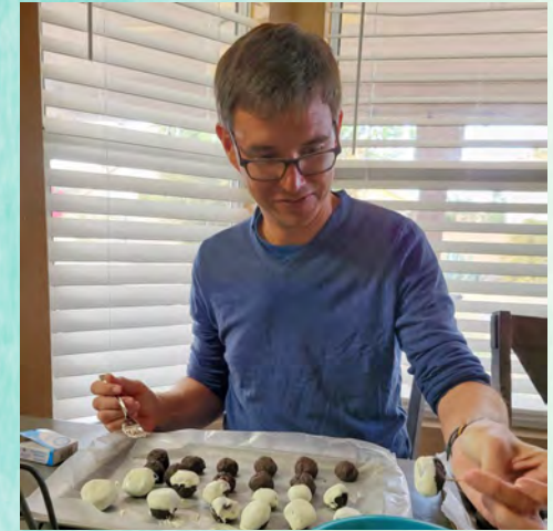
MAKING OREO TRUFFLES