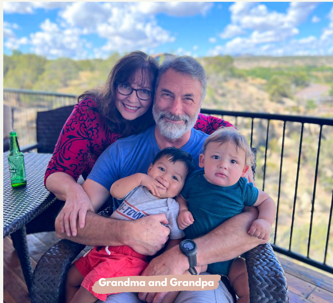
Grandma and Grandpa