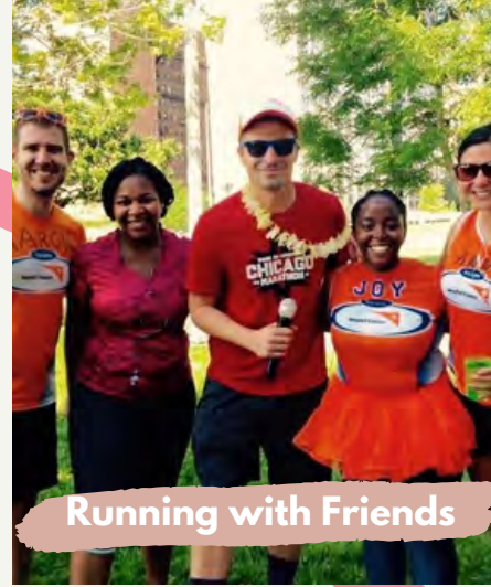
Running with Friends