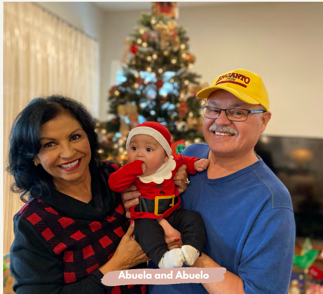
Abuela and Abuelo