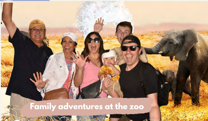
Family adventures at the zoo