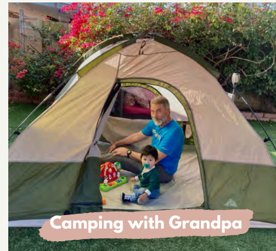
Camping with Grandpa