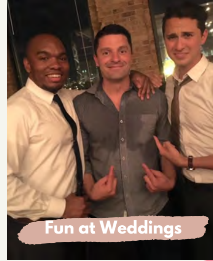
Fun at Weddings