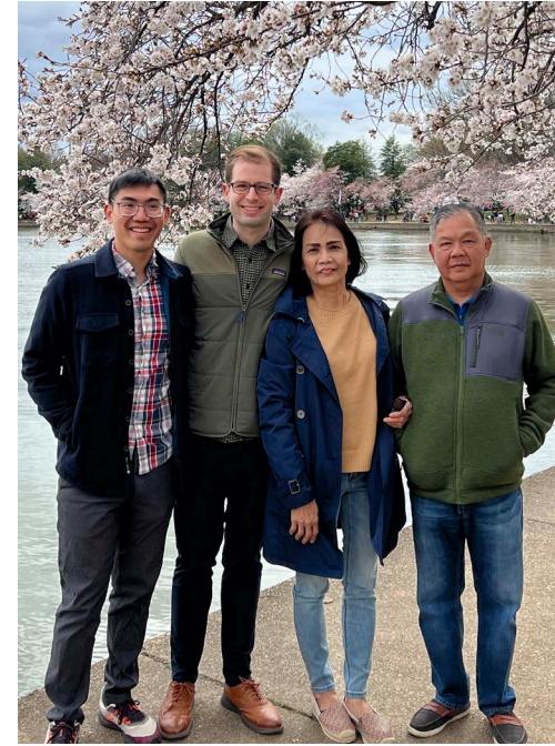
Touring the cherry blossoms