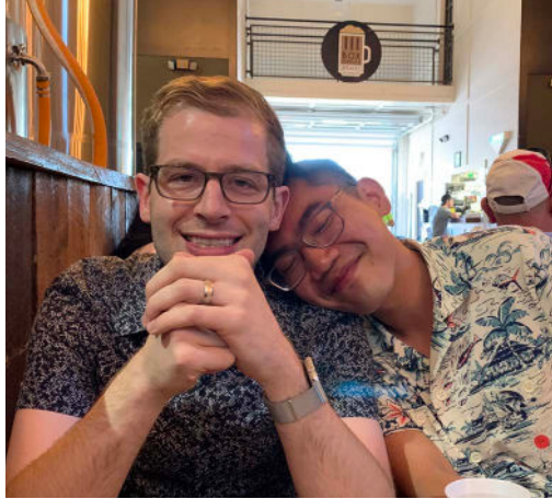
Exploring local Restaurants