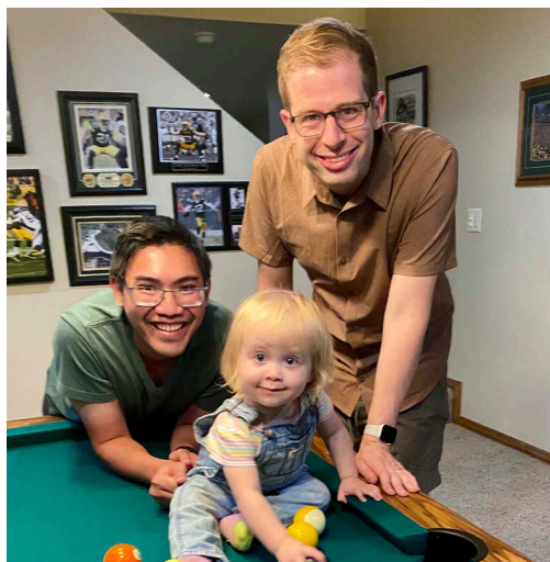
We love our niece