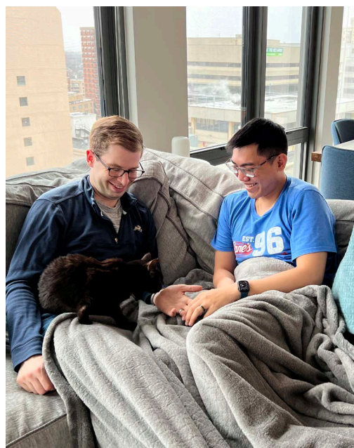
Relaxing with Elba

On Saturdays, our neighborhood has a farmers' market that we have become regulars at. Your child will be able to try new, fresh food and take part in this community. We are lucky to have neighbors who are friendly, outgoing, and have growing families of their own. Their kids play in the building's outdoor space and we are excited to join the fun with your child.