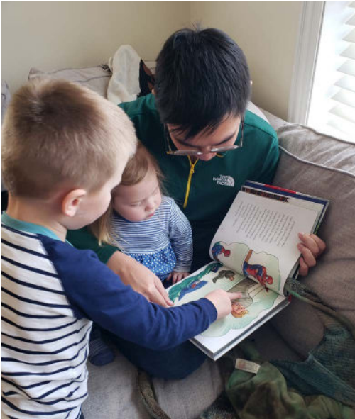
Reading with the kiddos