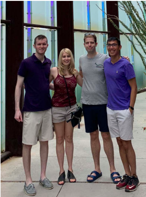
Family trip to Scottsdale