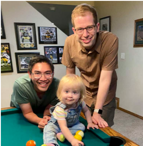
We love our niece