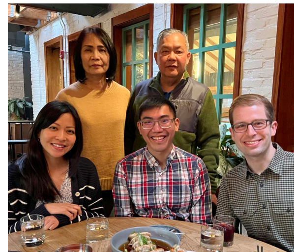
Family and food