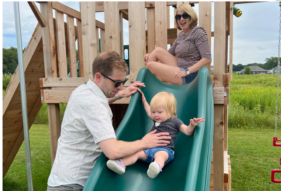
Learning to slide