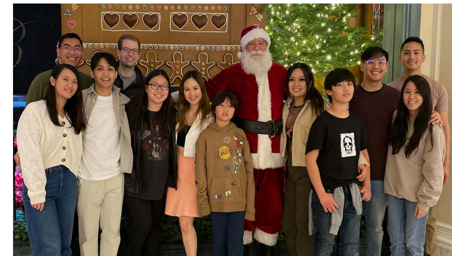
Christmas cousin outing