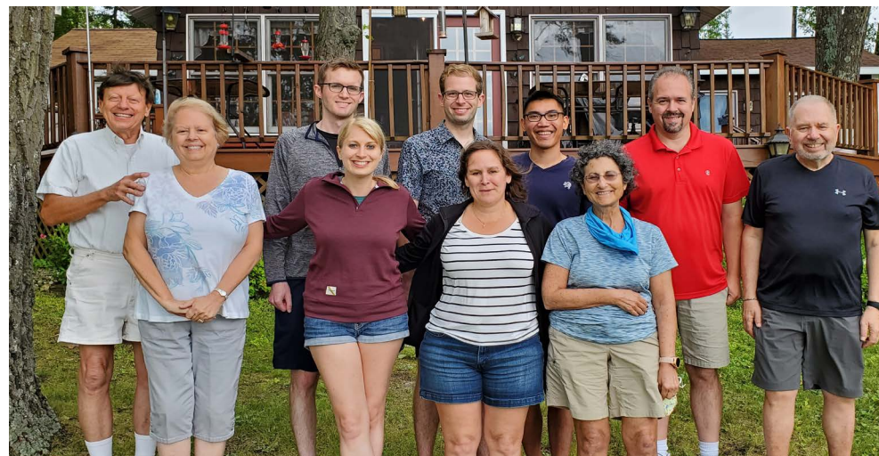
Family time at the cabin