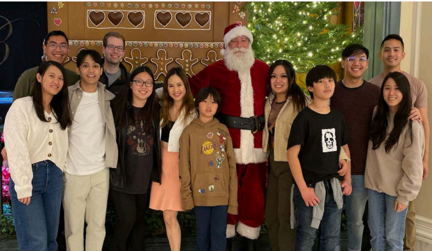
Christmas cousin outing