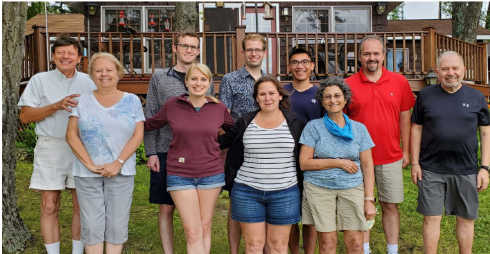
Family time at the cabin