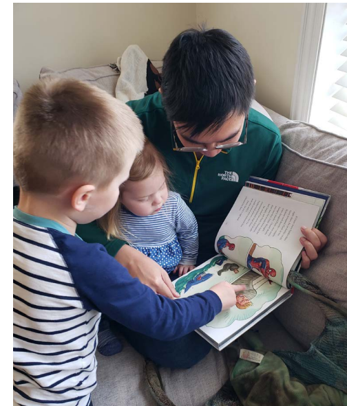
Reading with the kiddos