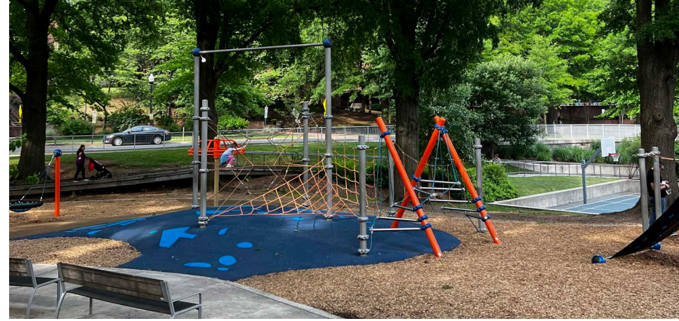
Our local park