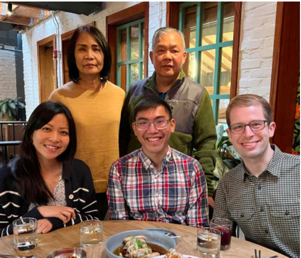
Family and food