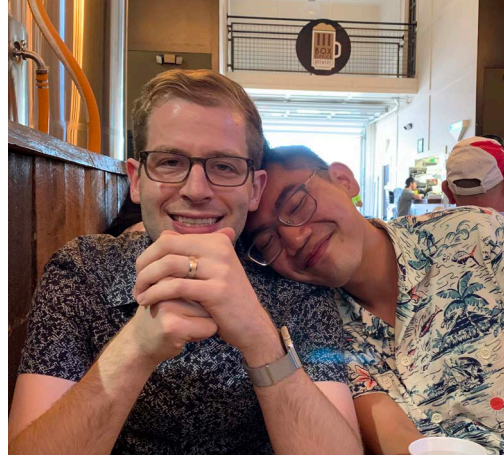
Exploring local Restaurants