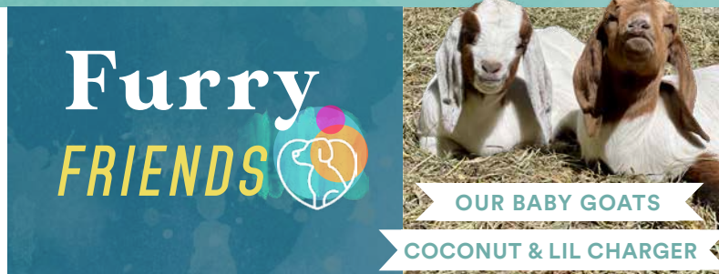
OUR BABY GOATS COCONUT & LIL CHARGER

We love animals and have a sweet little farm, with a few goats, a flock of chickens and fish in our small pond. We even have two baby goats who are so fun to watch and care for as a family.