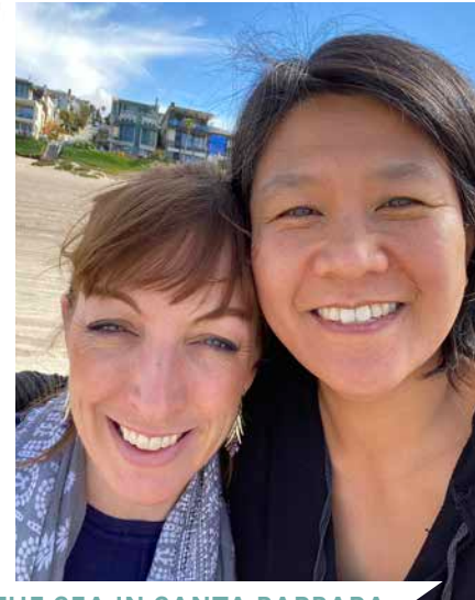
HAPPY BY THE SEA IN SANTA BARBARA