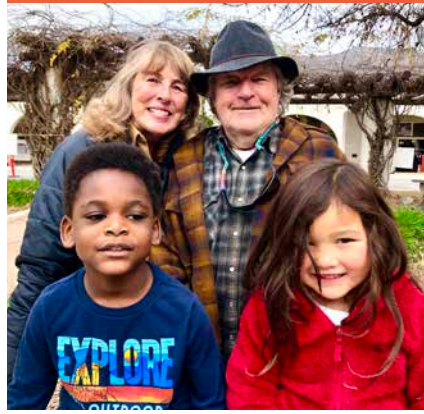
WITH THE GRANDPARENTS

Both of us are very close with our siblings and extended families, and our friends also play an important role in our lives.