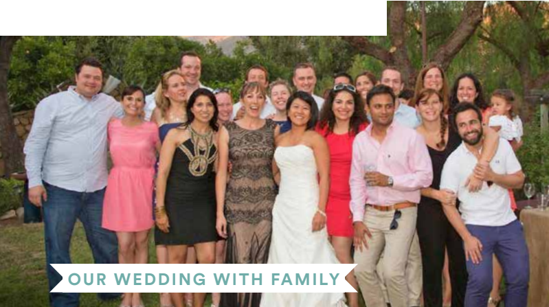
OUR WEDDING WITH FAMILY