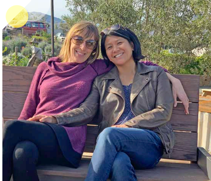
TAKING IN THE VIEW ON A ROADTRIP TO SAN DIEGO