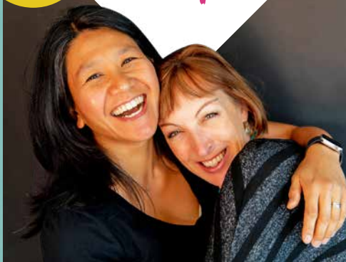
WE LAUGH A LOT!