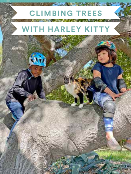
CLIMBING TREES WITH HARLEY KITTY