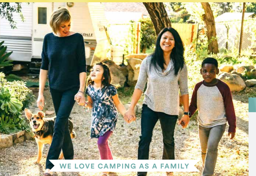
WE LOVE CAMPING AS A FAMILY

We also love traveling, especially when we can experience how other cultures experience food, family and fun, and we enjoy family trips so that we can share adventures with our kids.