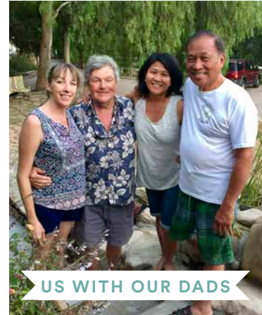
US WITH OUR DADS

We each have circles of friends from school, work and our childhood who we refer to as our “chosen families”. We really believe that families are created in many ways—so what is most important to us is the love, community and support we share with the people in our lives.