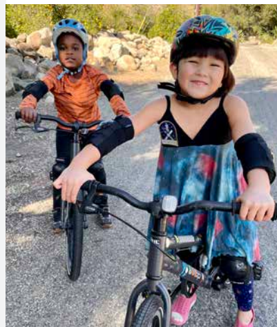
THE KIDS RIDING BIKES PLAYING IN THE POOL

Our yard backs up to a beautiful orange orchard, and we have plenty of yummy things growing in our own garden which we enjoy and share with our neighbors. We spend most of our days outside - picking fruit, bicycle riding, or playing with the animals.