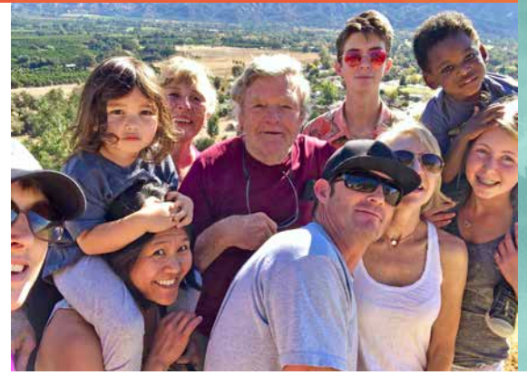
FAMILY HIKE ON NEW YEAR'S DAY