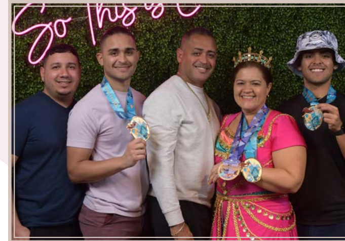
Finishing Princess Marathon