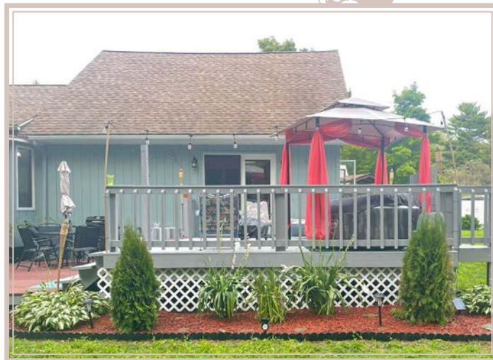
Our patio and yard

When we first saw our home, we knew it was meant for us because we both felt the peace, tranquility, and happiness it gave us. At that moment, we knew this was the house of our dreams. Our home is in Pennsylvania, in the middle of nature with a view of a lake. It is a beautiful piece of land where our future children can grow, run, and enjoy the wonders of life. We love our house, and every day we work hard to maintain its essence and the warmth it transmits to us and those around us.