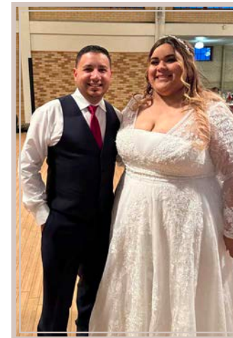
Best friends since 2009