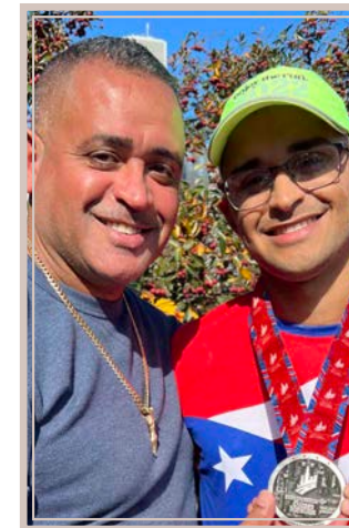
My dad is my hero