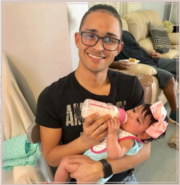
I love my cousin