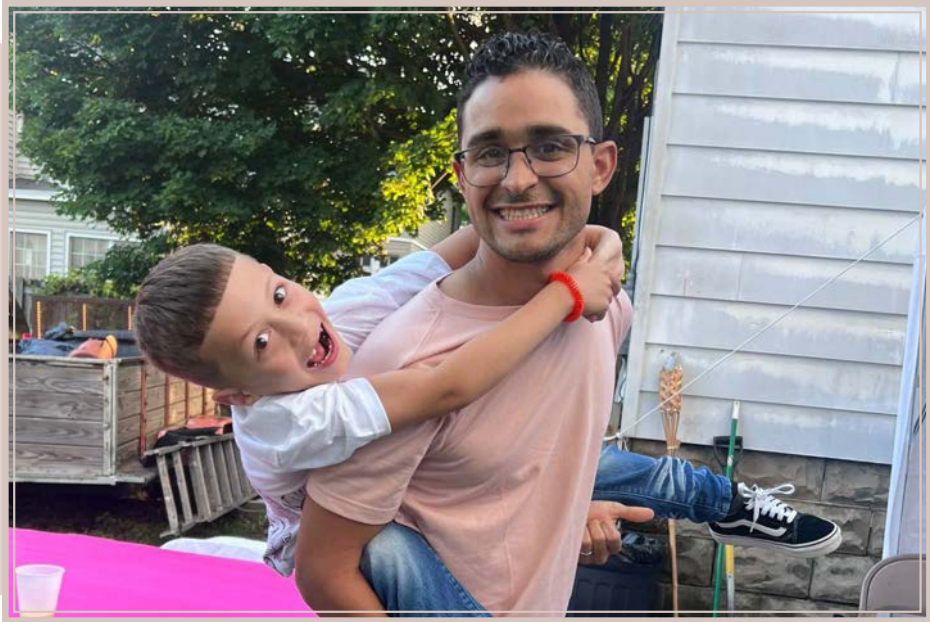
Party day with my godson