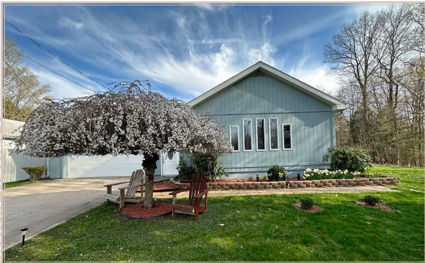
Our lovely home