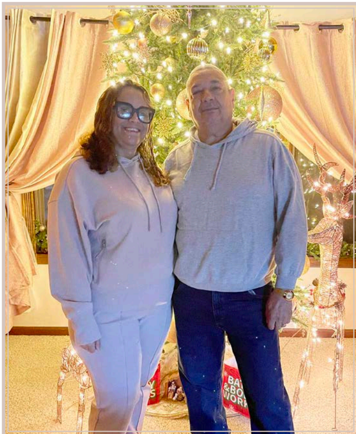
Christmas vacation with family

We have a good mix of friends who have multiple children of varying ages, and we enjoy often celebrating special occasions together or spending time. Our friends support us and always looking for the best of us. We are so fortunate to have such a wonderful, strong bond with our friends and their families.