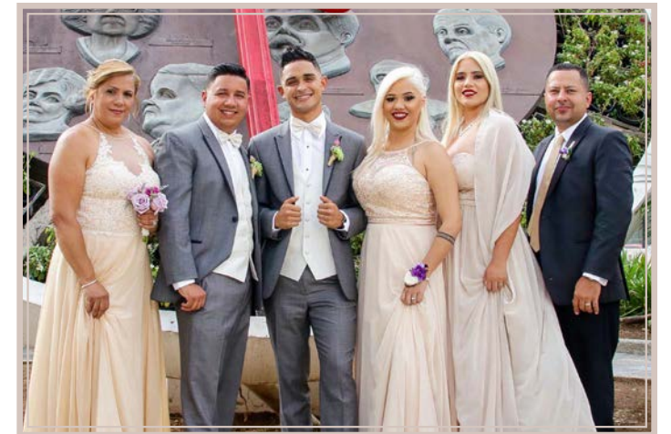
Our family is amazing

“Both of our families are very caring and supportive, and they are so excited to welcome a new addition to our family via adoption.”