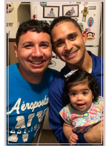
Babysitting our cousin