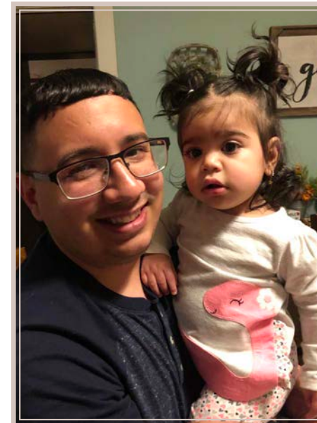
Cuddling with my niece