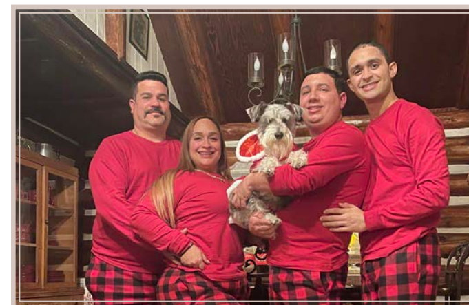
Our friendship is extraordinary

“Both of our families are very caring and supportive, and they are so excited to welcome a new addition to our family via adoption.”