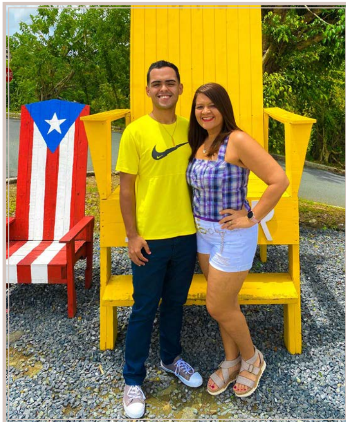
Moments with Mom and Brother