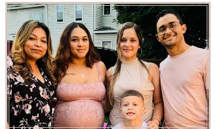
With wonderful friends