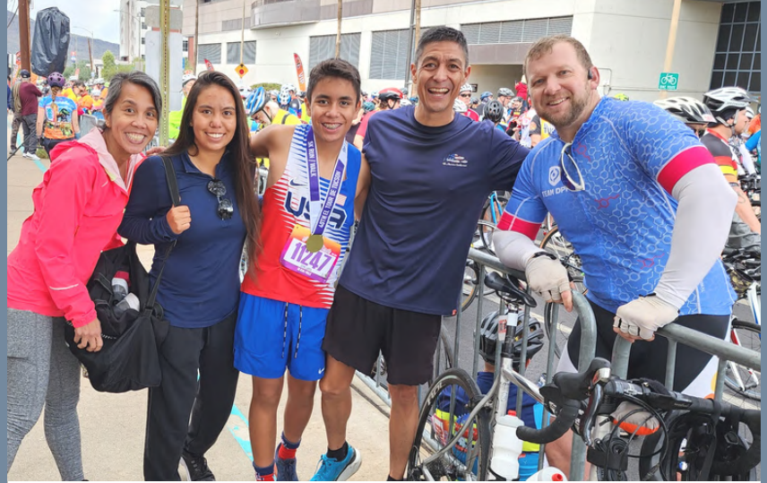
FRIENDS CAME TO SEE TROY OFF AT THE START OF A BIKE RACE