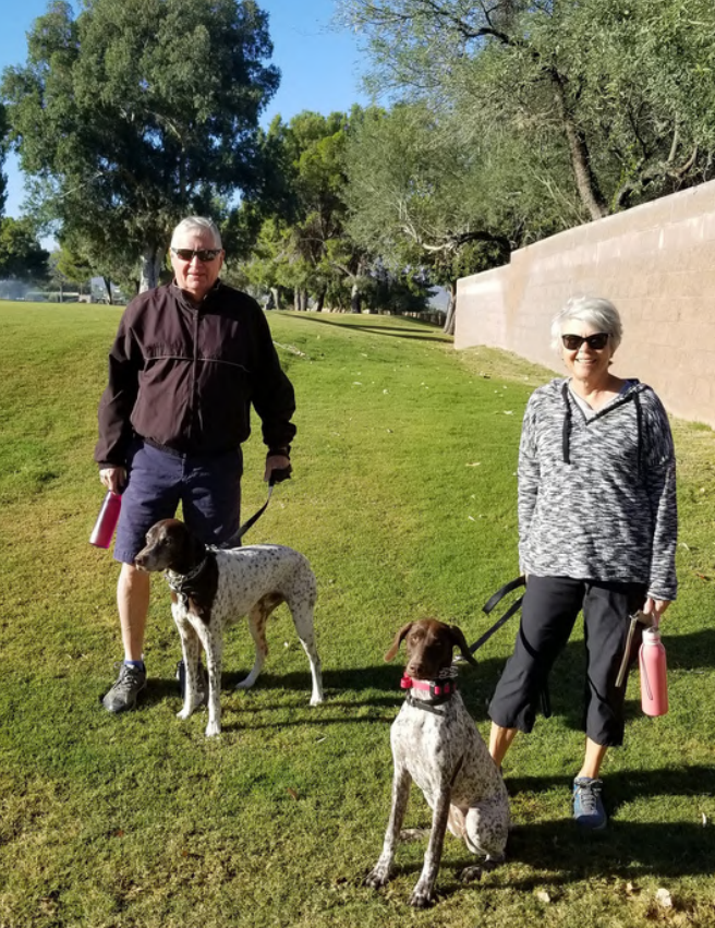
MEETING UP WITH HER PARENTS FOR A WALK