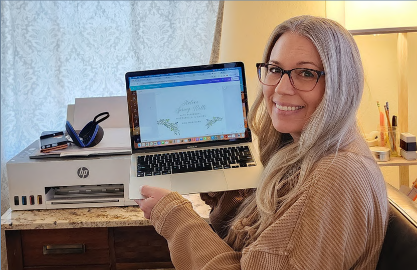
DESIGNING FOOD TABLE SIGNS FOR A FRIENDS WEDDING

SHE LOVES TO BE OUTSIDE AND IS VERY CREATIVE!