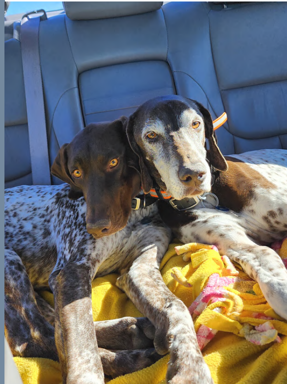
SETTLED IN FOR A ROAD TRIP