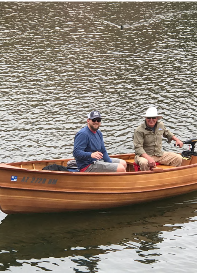
CARMEN'S DAD BUILT A WOODEN BOAT!