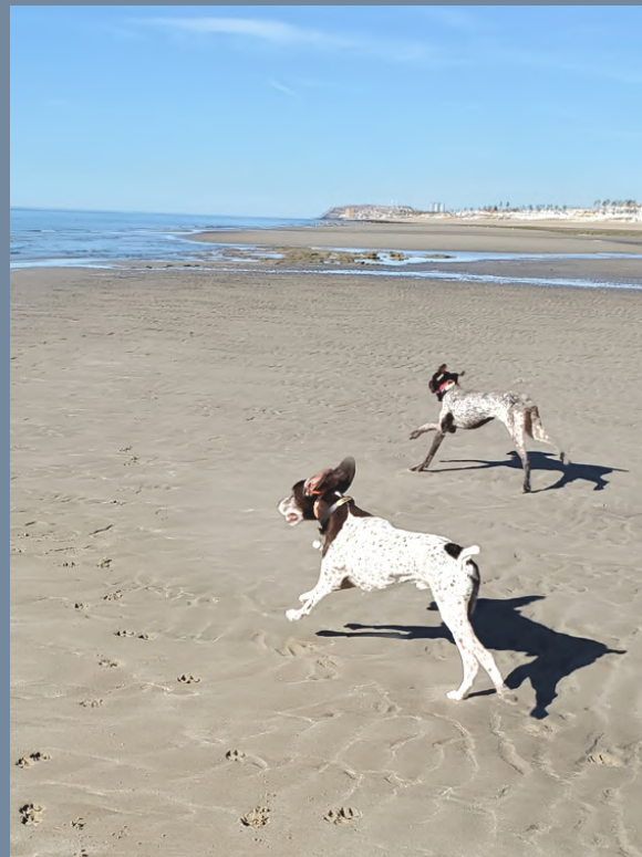
GETTING TO RUN ON THE BEACH!