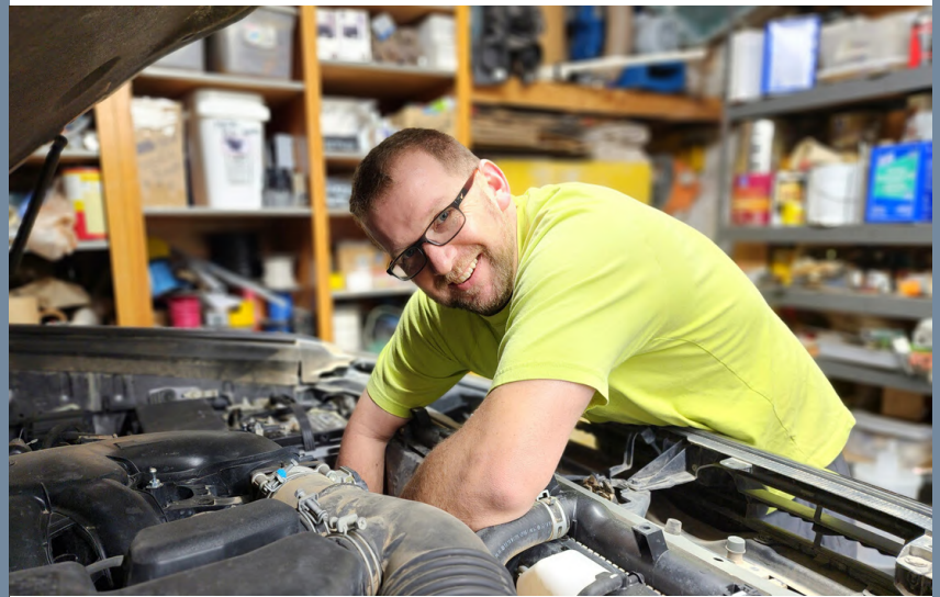
WORKING ON OUR CAR