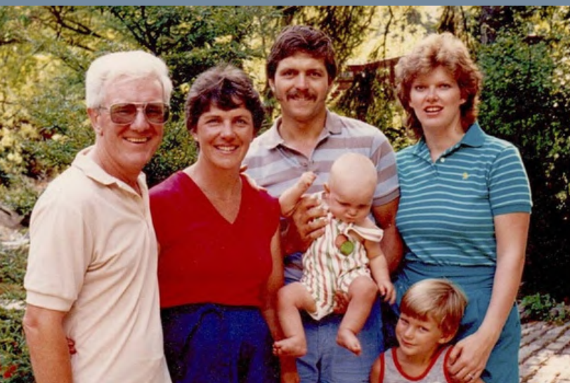
TROY'S DAD & BIRTH MOTHER MEETING FOR THE 1ST TIME