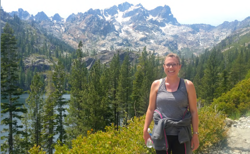
WALKING TO A LAKE IN CALIFORNIA