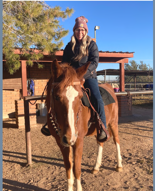
SELFIE WITH THE BESTIES