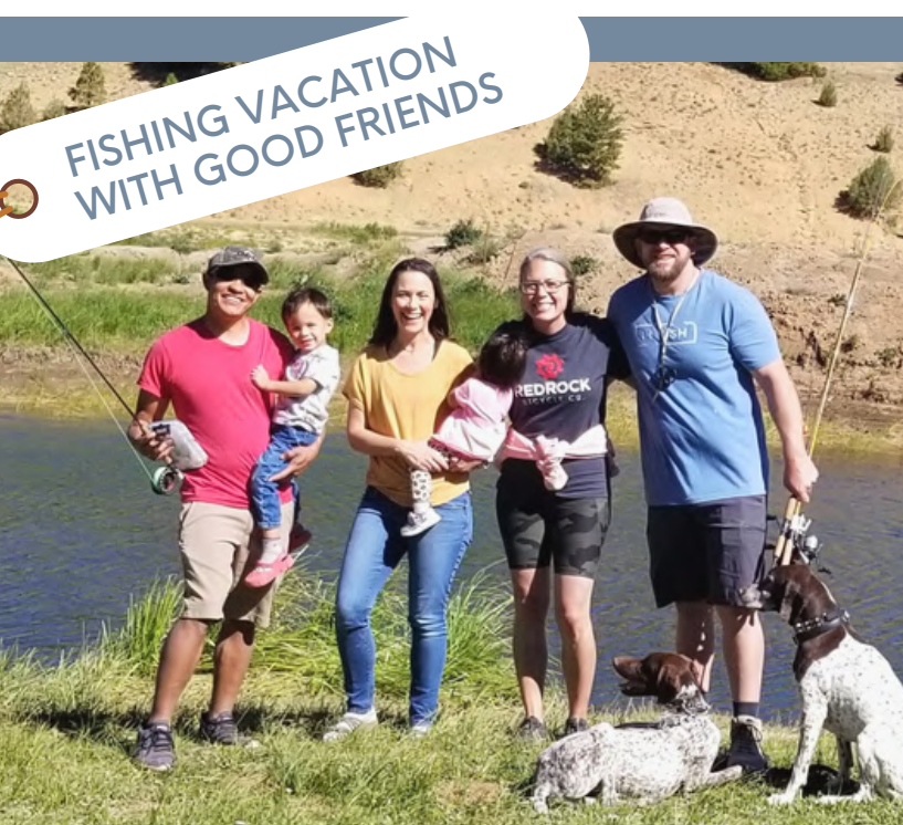
FISHING VACATION WITH GOOD FRIENDS