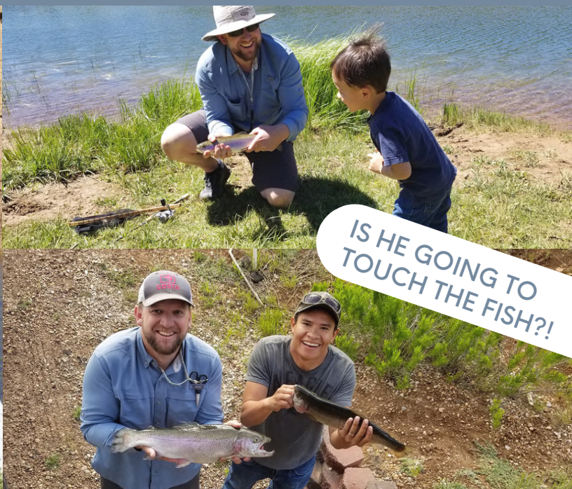
IS HE GOING TO TOUCH THE FISH?!