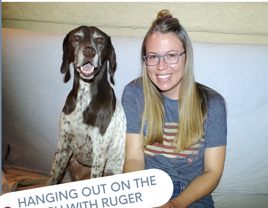
HANGING OUT ON THE PORCH WITH RUGER

Our dogs are both German Shorthaired Pointers. We got Ruger 7 years ago from a family that couldn't keep him anymore, and then a couple years ago we got Remi when she was a puppy. They are our exercise buddies and best pals to each other.