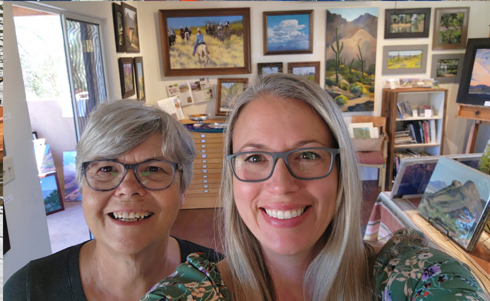
CARMEN'S MOM LOVES TO PAINT