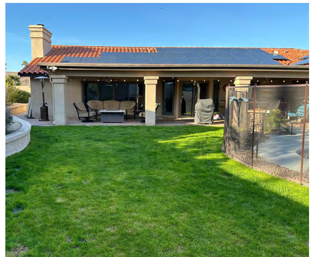
Grassy yard to play in

Our house isn't always perfect, but we do our best to put away the dog toys and make the bed! We have an extra bedroom that will be great for a child.