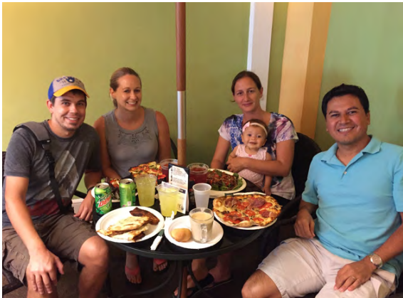
Eating out with friends