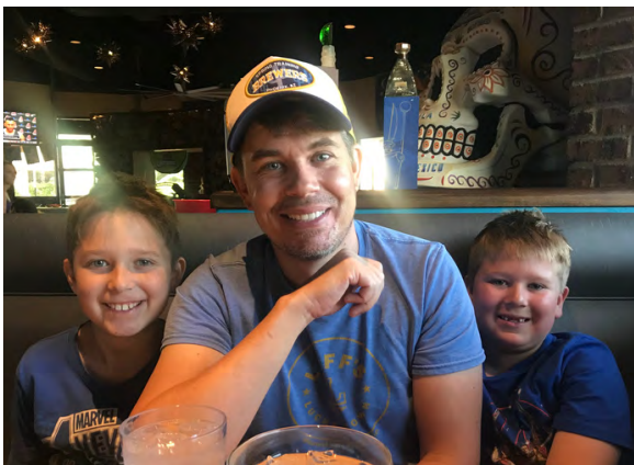
Dinner with nephews