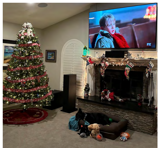
We love to decorate for the holidays!