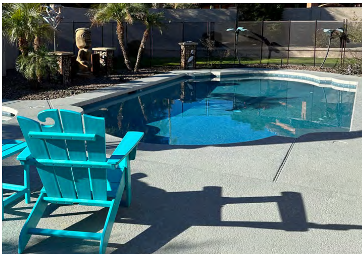
Backyard & pool - fenced for safety!