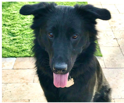
Nala, our 6-year-old mixed breed

Nala is a very happy dog who likes to explore the grassy yard and give kisses. Most of all, she loves meals and snacks!