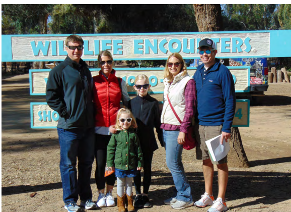
Zoo with Laura's brother's family