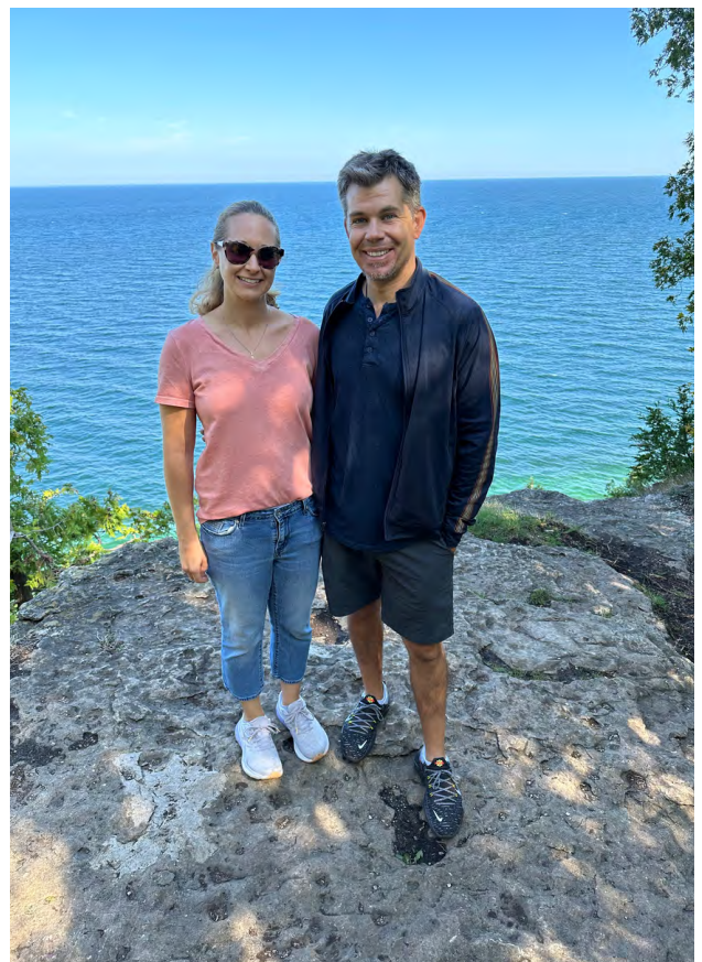
At a lake in Wisconsin