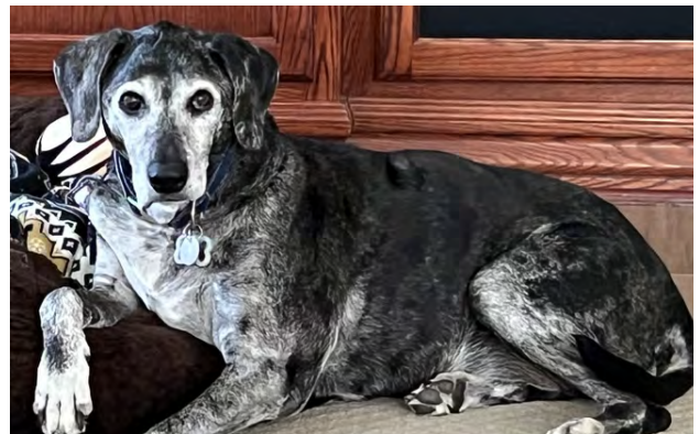
Gypsy, our 14-year-old pointer/hound mix

Gypsy mostly enjoys taking naps these days, but she also loves going on walks, laying in the sun, and snuggling!