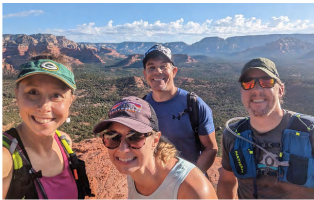
Hiking with friends