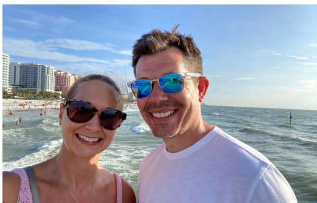
Florida beach trip