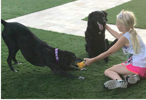
Our two rescue dogs love to play with our nieces and nephews!