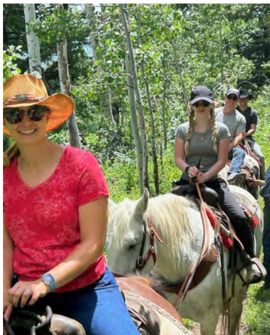
Horseback riding with family