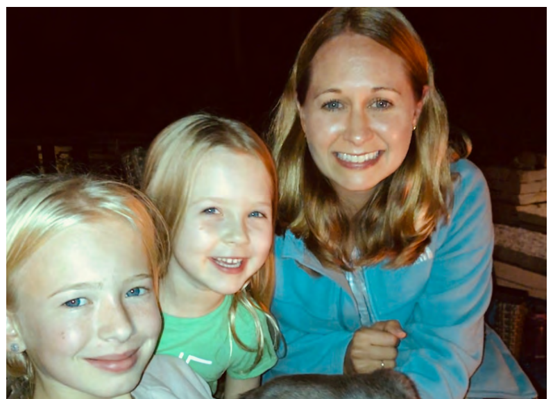
Sleepover and campfire with our nieces