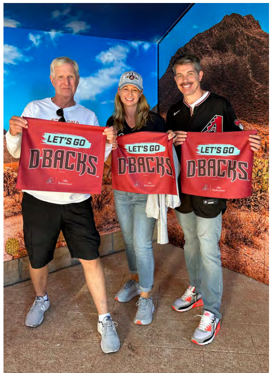
Baseball game with Laura's dad