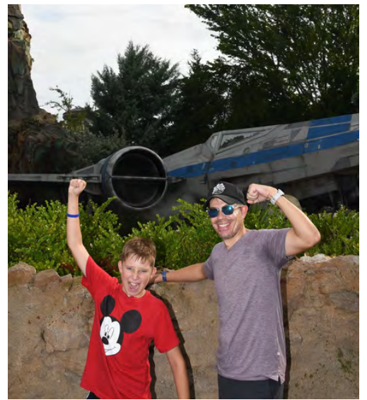
Disney trip with our nephew