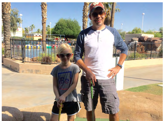
Mini golf with our niece