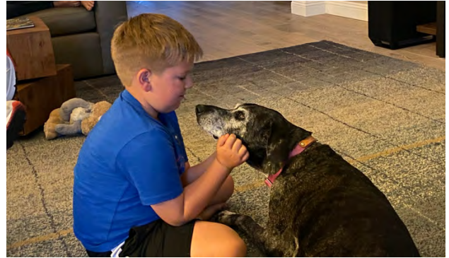
Gypsy and our nephew