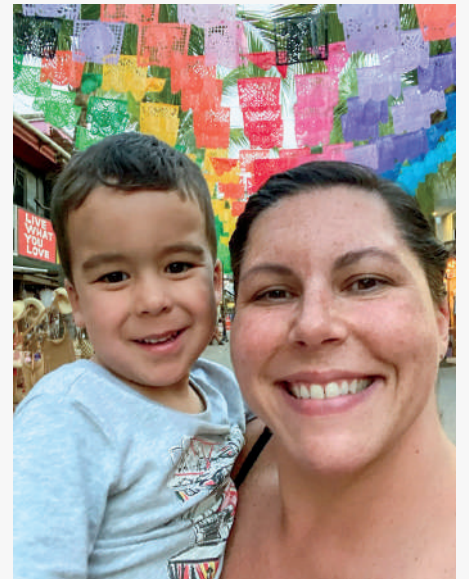
Beautiful colors of Mexico