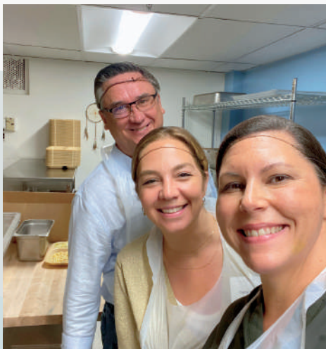
Volunteering at a food bank