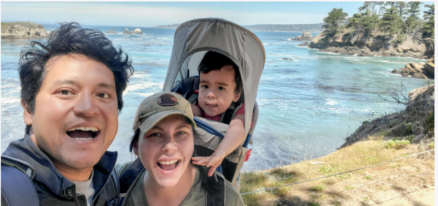
Point Lobos State Park, CA