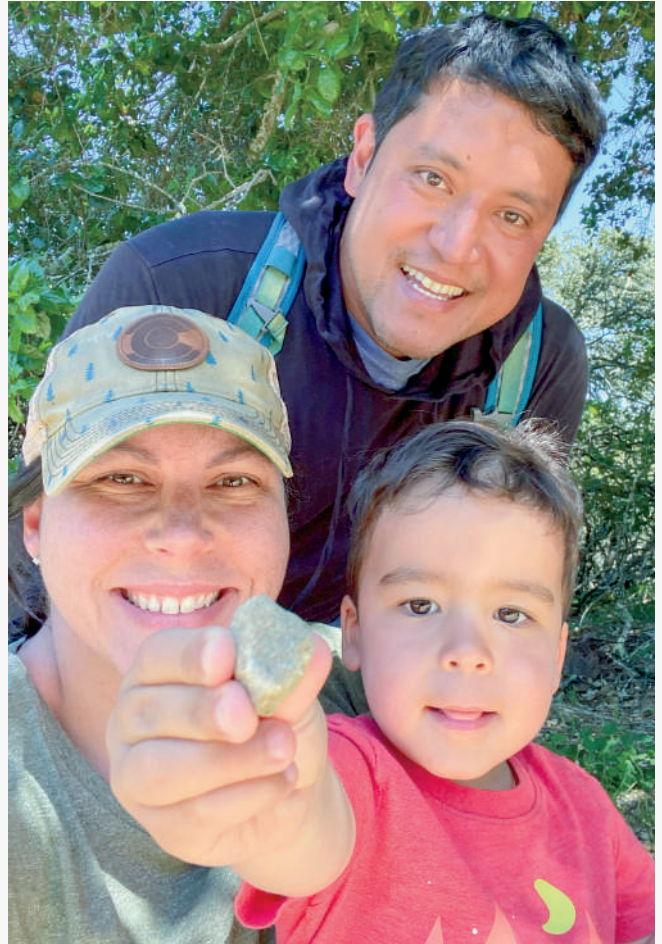
Hiking in Monterey

Both of us grew up with siblings, so we know how important it is for our children to have that experience too.