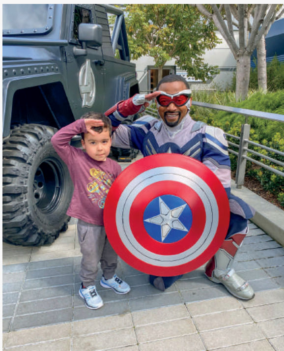
Meeting Captain America