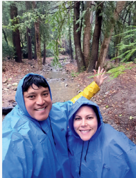
Glad we brought the ponchos