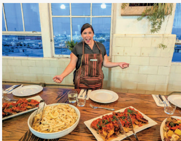
Pasta making classes