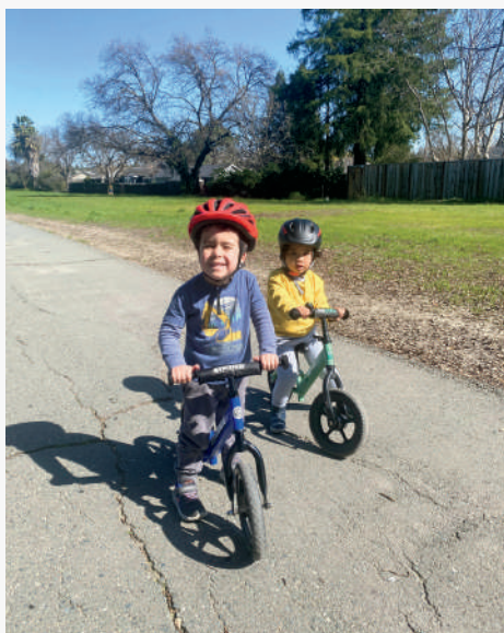
Riding bikes on the trail