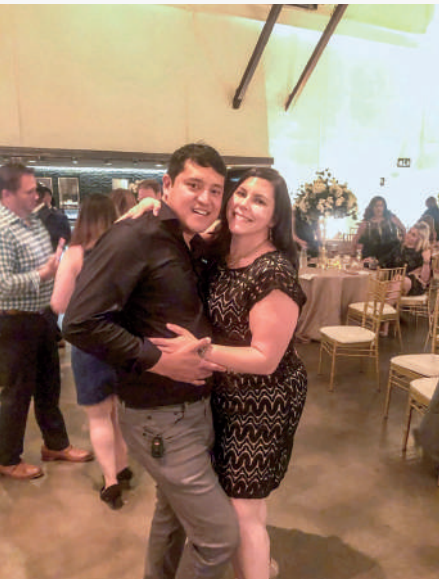
Dancing the night away