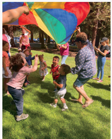
Birthday party in the park