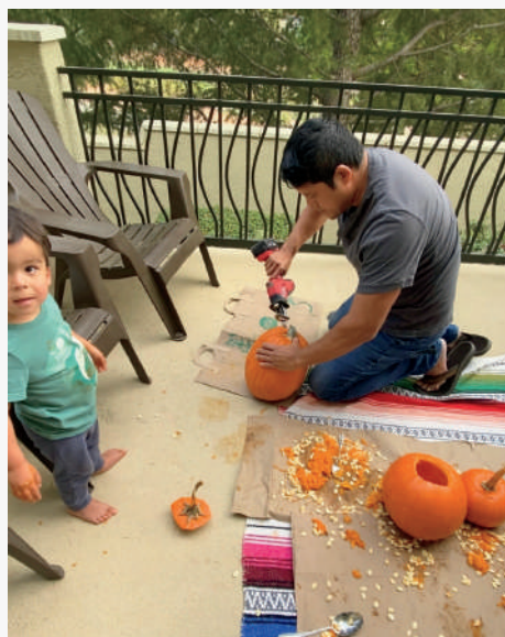
Carving pumpkins on the porch