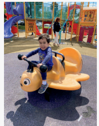
Day at the park