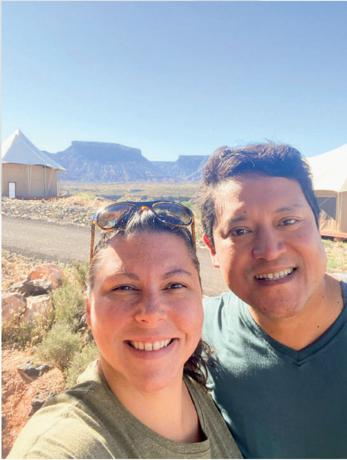
Camping in yurts at Zion National Park, UT