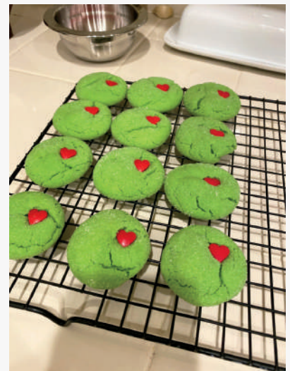
Grinch Stole Christmas cookies

During Christmas Gwen bakes so many cookies that we spend days taking cookie boxes to friends and neighbors. The cookies are delicious!