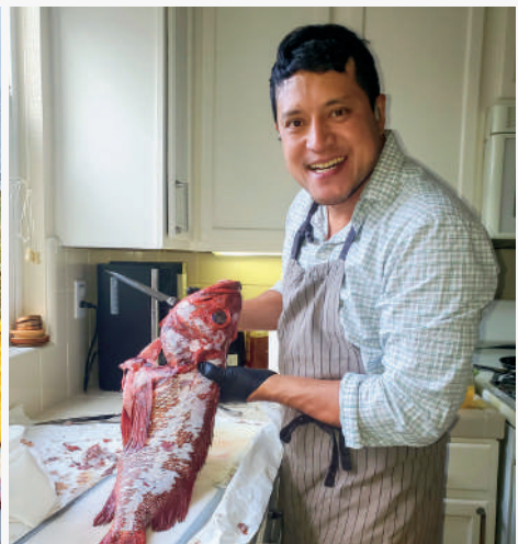
Serving up local fresh fish