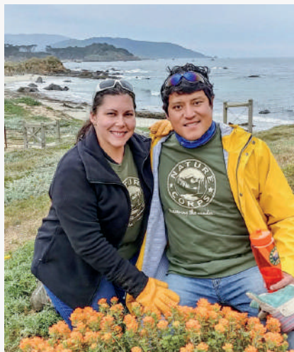
Volunteering in Big Sur, CA