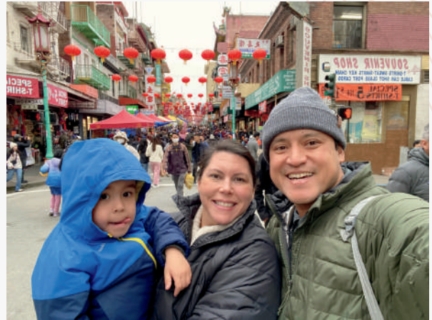
Chinese New Year

We take advantage of all that California has to offer. We hike the redwoods, we explore the beach, we volunteer, and we also go to city events, like the Latin Jazz Festival or the Chinese New Year. There is good food, fun places, and plenty of things to do!