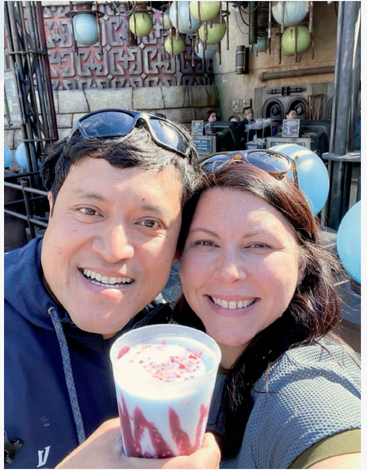
Milk Stand in Star Wars, Disneyland