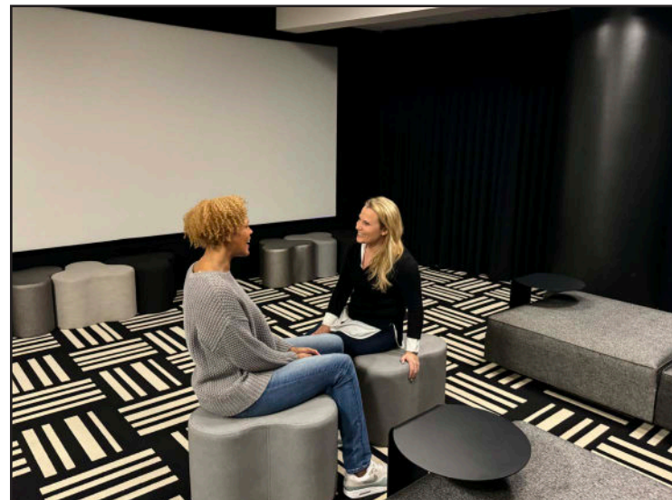
Theater room entertainment

We frequently use our community's indoor swimming pool, theater room, workout room, and nursery ... it's the perfect spot for kids and adults.