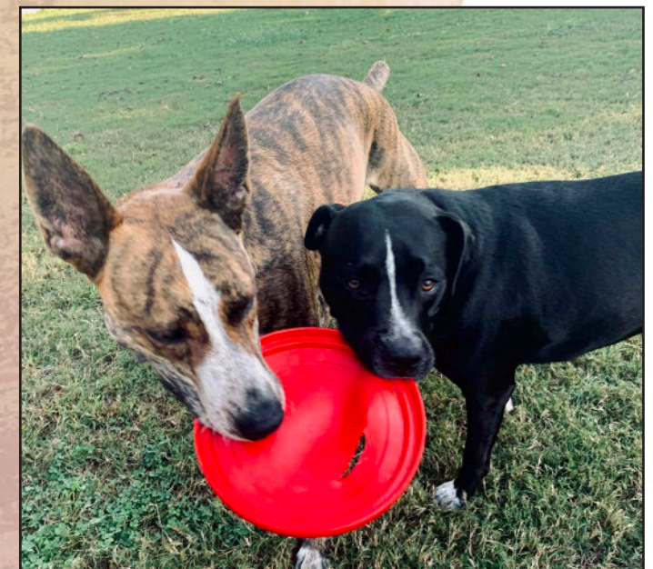
Frisbee in the park

We have two rescue dogs, Chance and Max. Chance is a German Shepherd-Boxer mix and Max is a Lab mix. We rescued both of them without thinking twice about it, when no one else wanted them. They are perfect for us. And not a day goes by that we don't love on them with hugs and kisses, and walks and playtime at the dog parks. Chance will be the greatest big brother, he loves kids and is around them all the time. Max is such a cuddly sweetie. We've had friends visit with their kids and make comments, "Your dogs are so good with our kids!" Chance and Max can't wait to be big brothers!