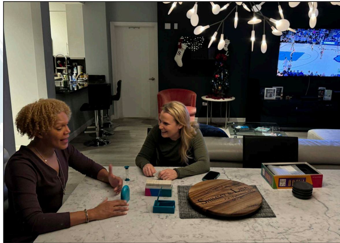
Game night at home!