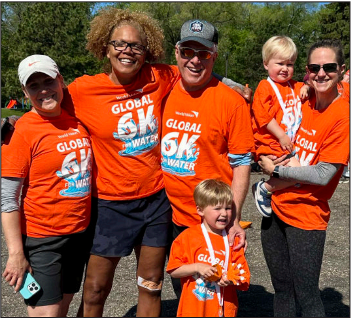
5K with friends

"Show me who you walk with and I'll show you who you are." That sums up our circle of friends, who in many ways represent us. Our core group of friends, our circle as we like to say, are diverse in age, race, religion, socioeconomic background, sexual orientation, and careers but what they all have in common is they are good, high character people, who love and support us.