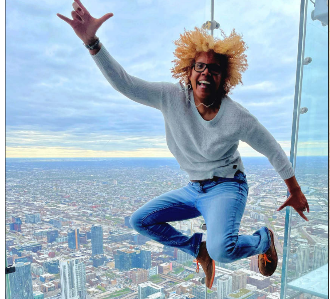
Storytime with Godmom Shimmy