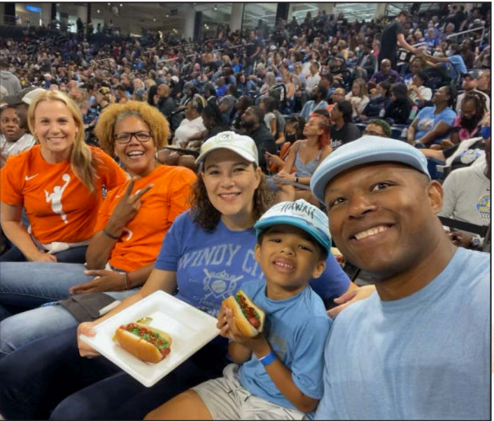
Basketball, hotdogs, and besties!