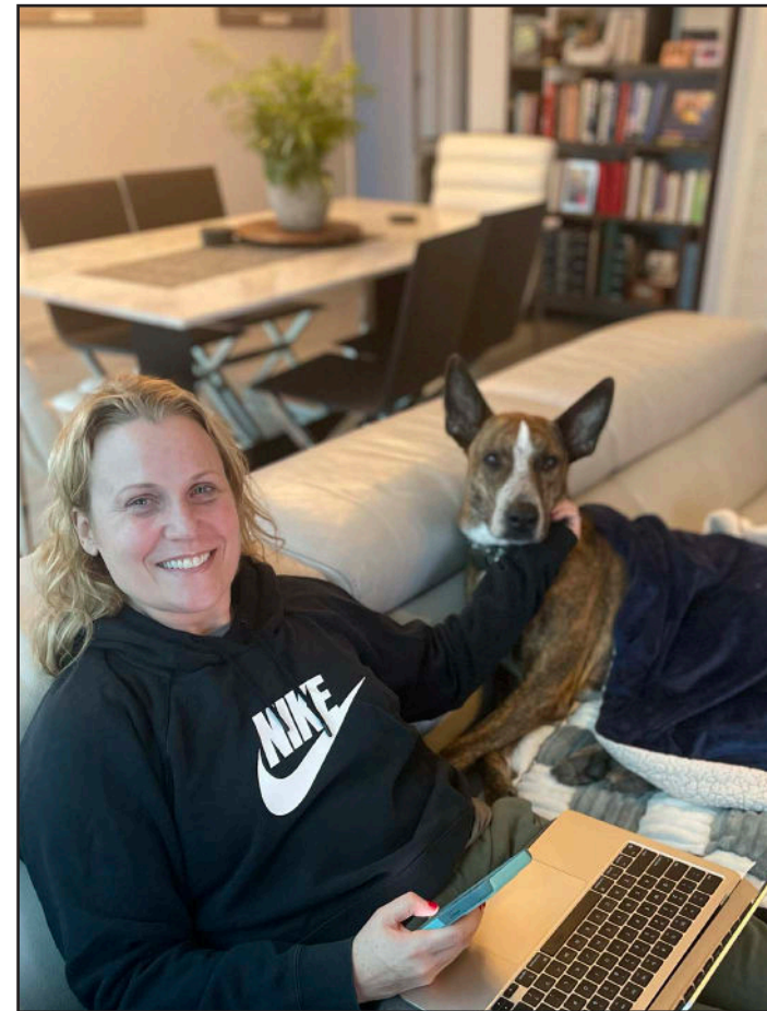
Chance helping mom work!