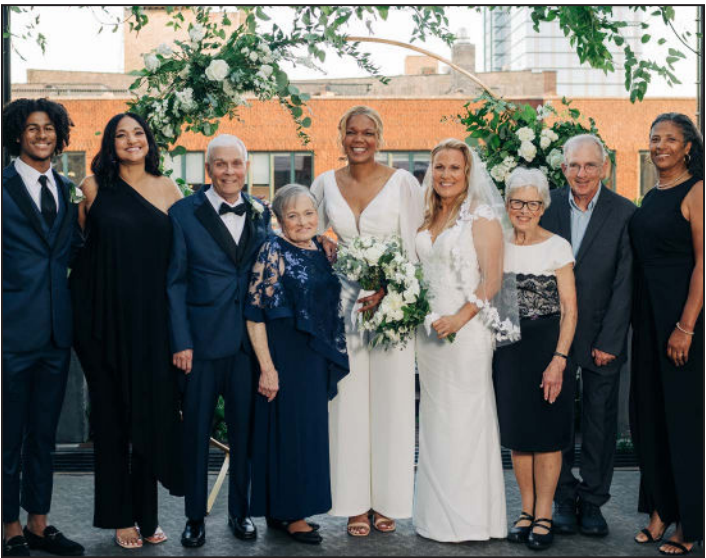
Special Day. Special People.