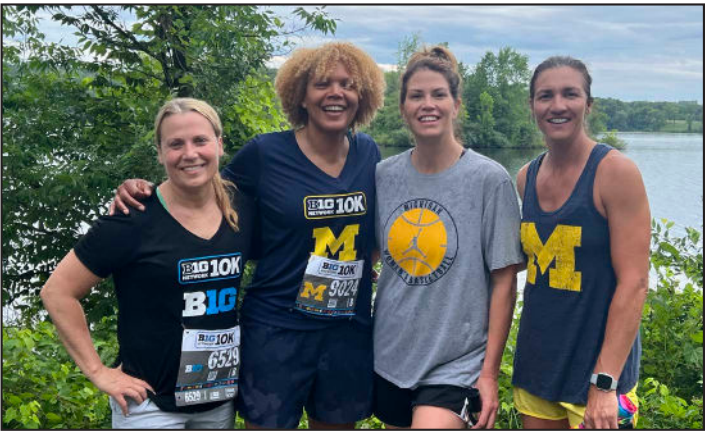
Another day, another 5k!