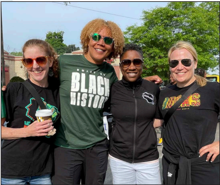
Juneteenth Parade with friends