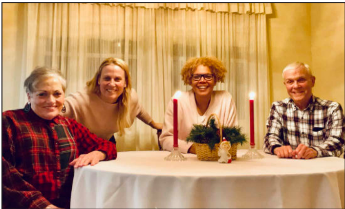
Christmas Eve family love