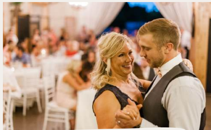
Mom and son Dance.