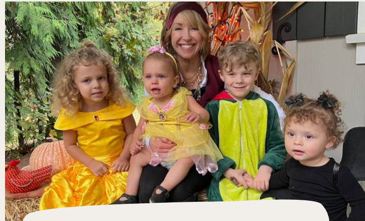
Cousin Halloween Festivities .